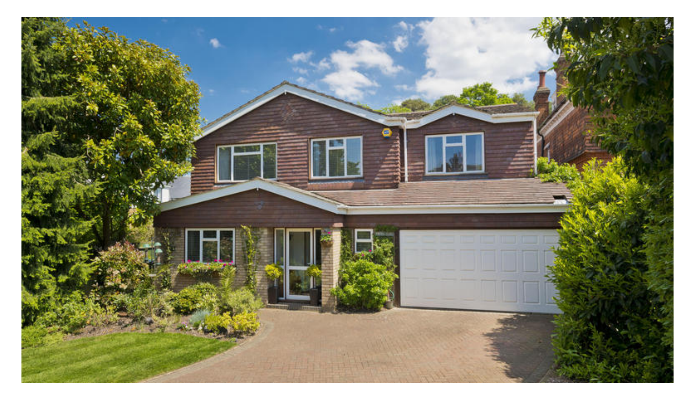
Family home with spacious accommodation

Clevelands, 66a St Marys Road, Weybridge, Surrey KT13 9QA