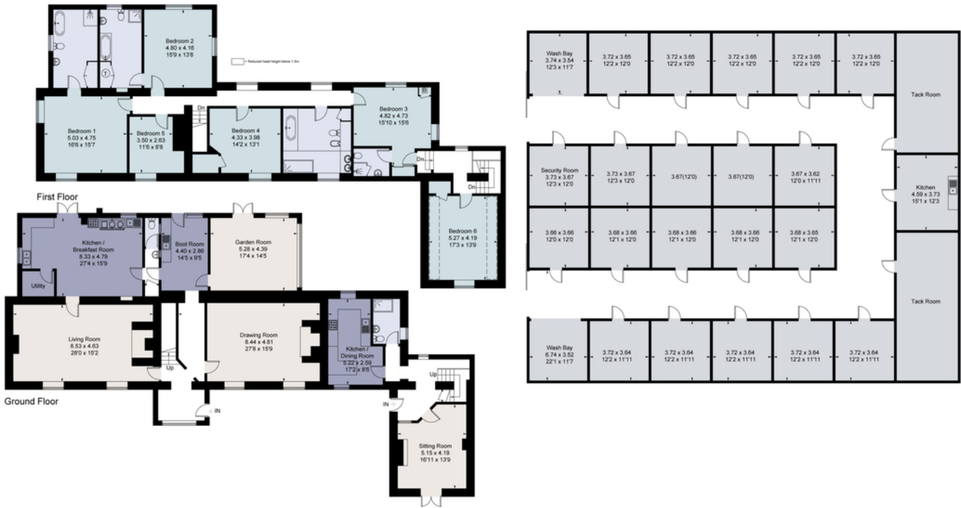
Drawn for illustration and identification purposes only by fourwalls-group.com 272553