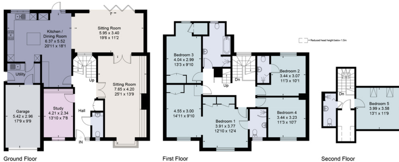
Surveyed and drawn in accordance with the International Property Measurement Standards (IPMS 2: Residential) fourwalls-group.com 300653