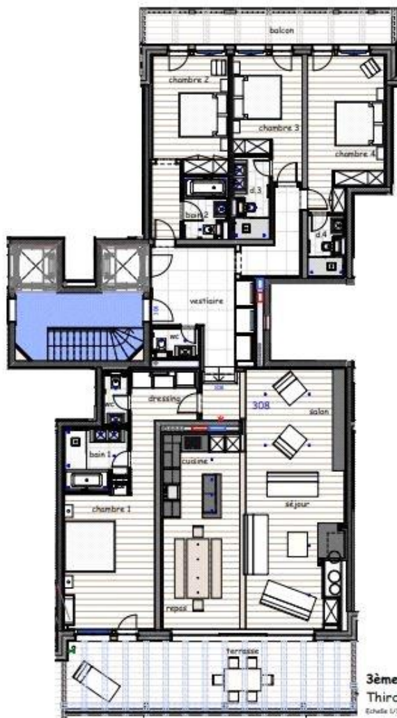
3ème ETAGE Third Floor Echelle 1/300ème