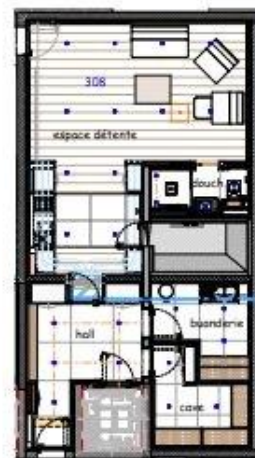
REZ-DE-CHAUSSEE Ground Floor Echelle 1/300ème

Verbier Sam Scott sam.scott@savills.com + 41 27 565 89 40