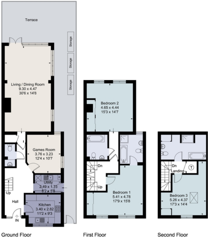
Drawn for illustration and identification purposes only by fourwalls-group.com 296436

Approximate Floor Area = 180.5 sq m / 1943 sq ft