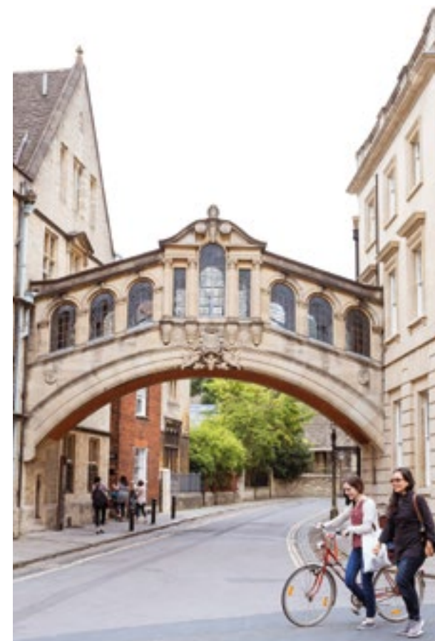
Bridge of Sighs