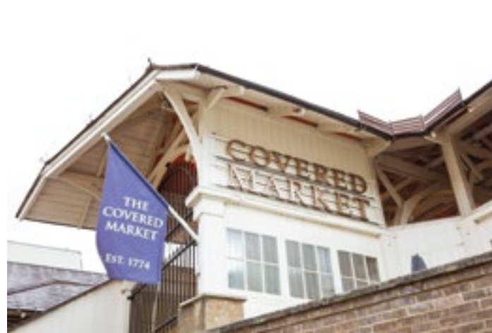
The Covered Market

Quirky boutiques, high street names and the famous covered market compete for the attention of shoppers, while the city's host of galleries, theatres and museums showcase the best of Oxford's history and culture.