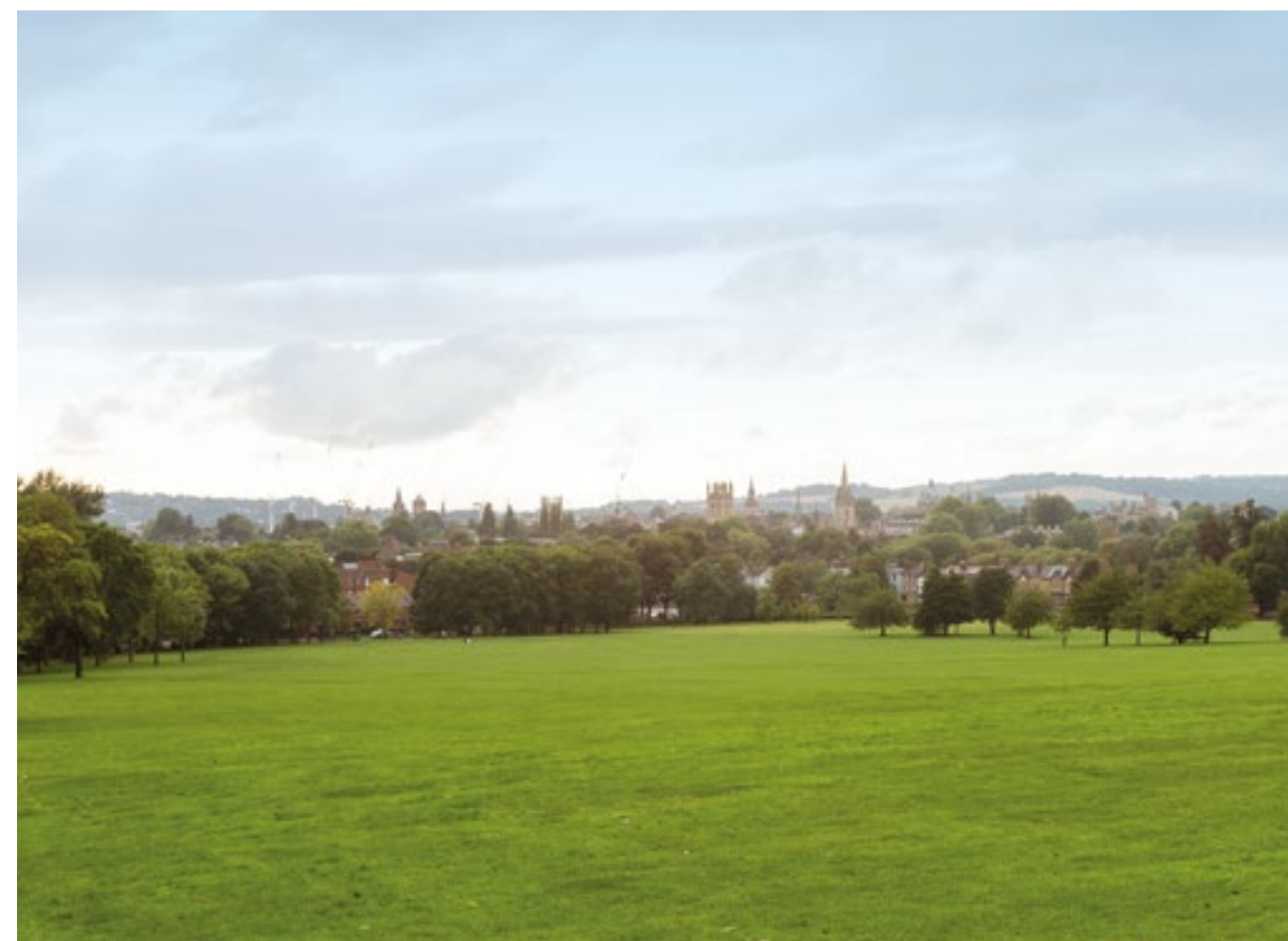
View of Dreaming Spires from South Park

But Oxford isn't just a city dominated by medieval learning and Georgian architecture. Nestled amongst the dreaming spires, history and culture intertwine with traditional theatres and pubs side-by-side with modern cinemas and cafés.