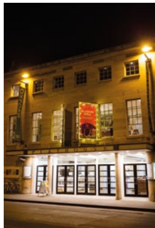
The Oxford Playhouse