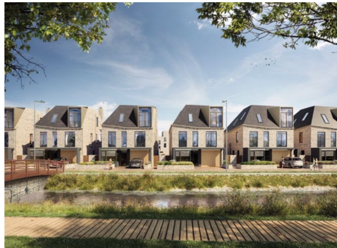
From left to right: Computer Generated Image of The Bayswater Villas, Bayswater Park and The Gladstone Crescent, Gladstone Gardens