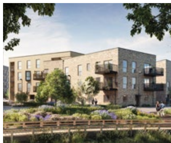
Computer Generated Image of the wooden walkways and Linear park