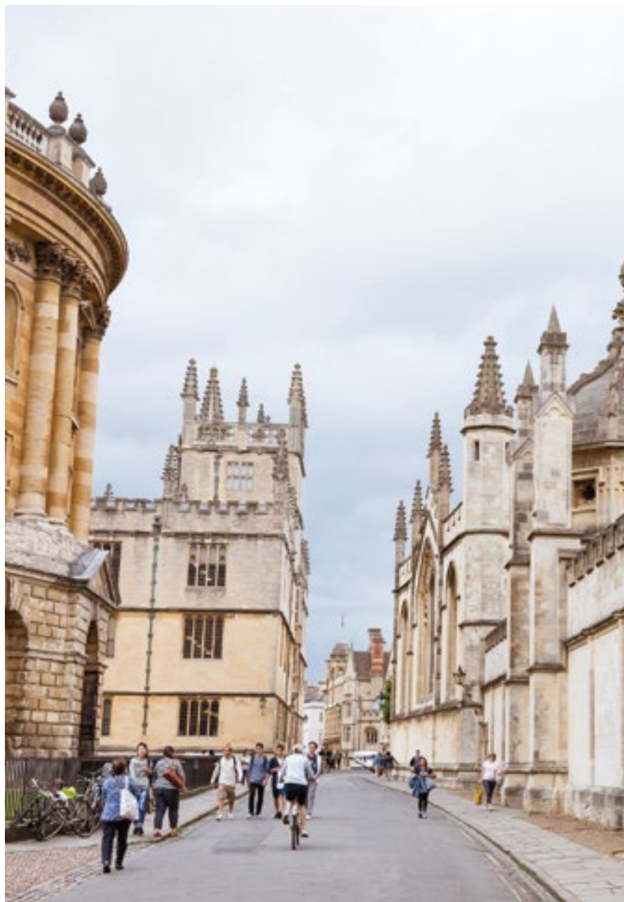
Cattle Street off Radcliffe Square