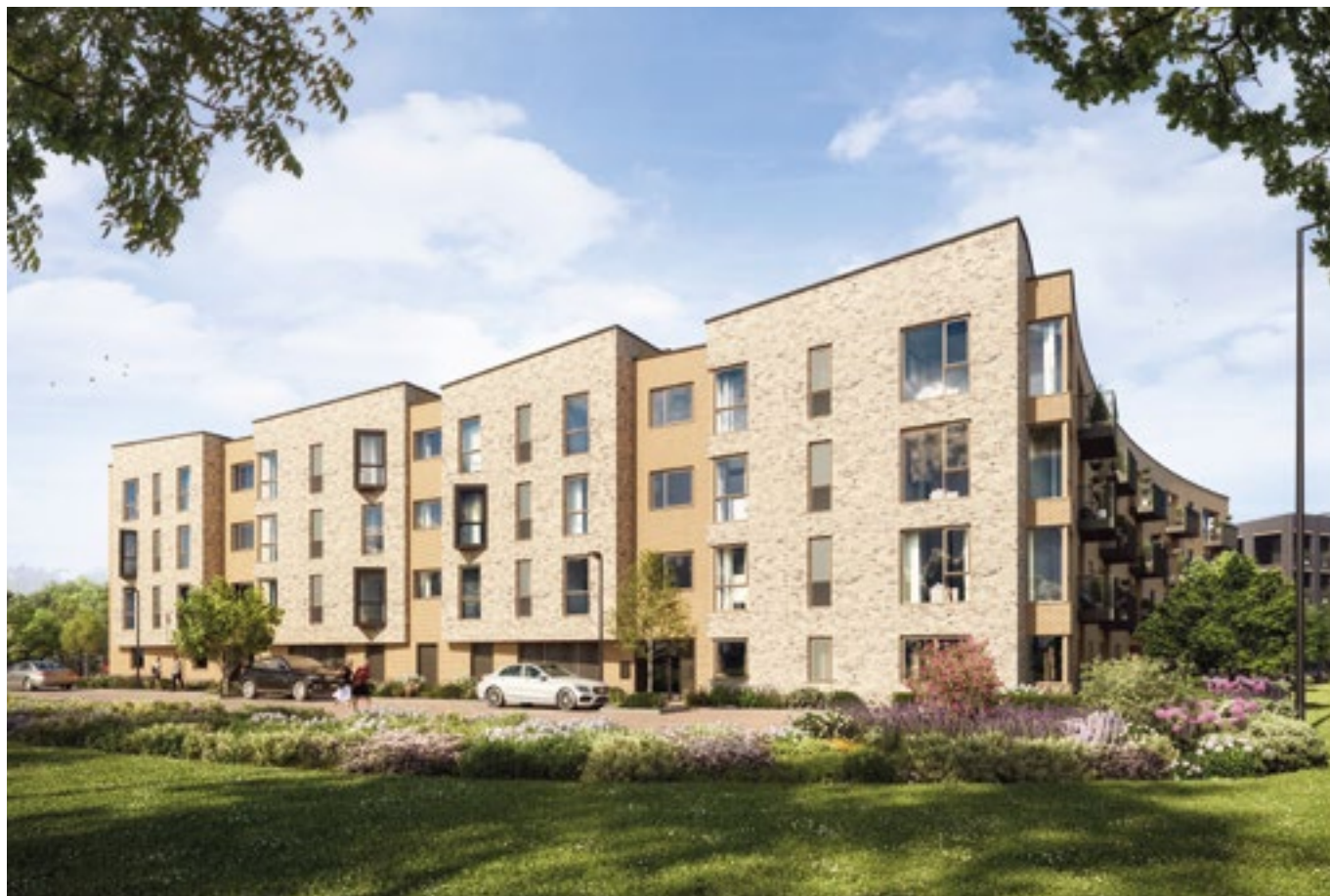
From left to right: Computer Generated Image of Attwood House and Elsfield House, Sydling Park

Each Mosaics apartment has been designed to respond to its specific location within the development, providing you with a range of options depending on your needs and requirements.