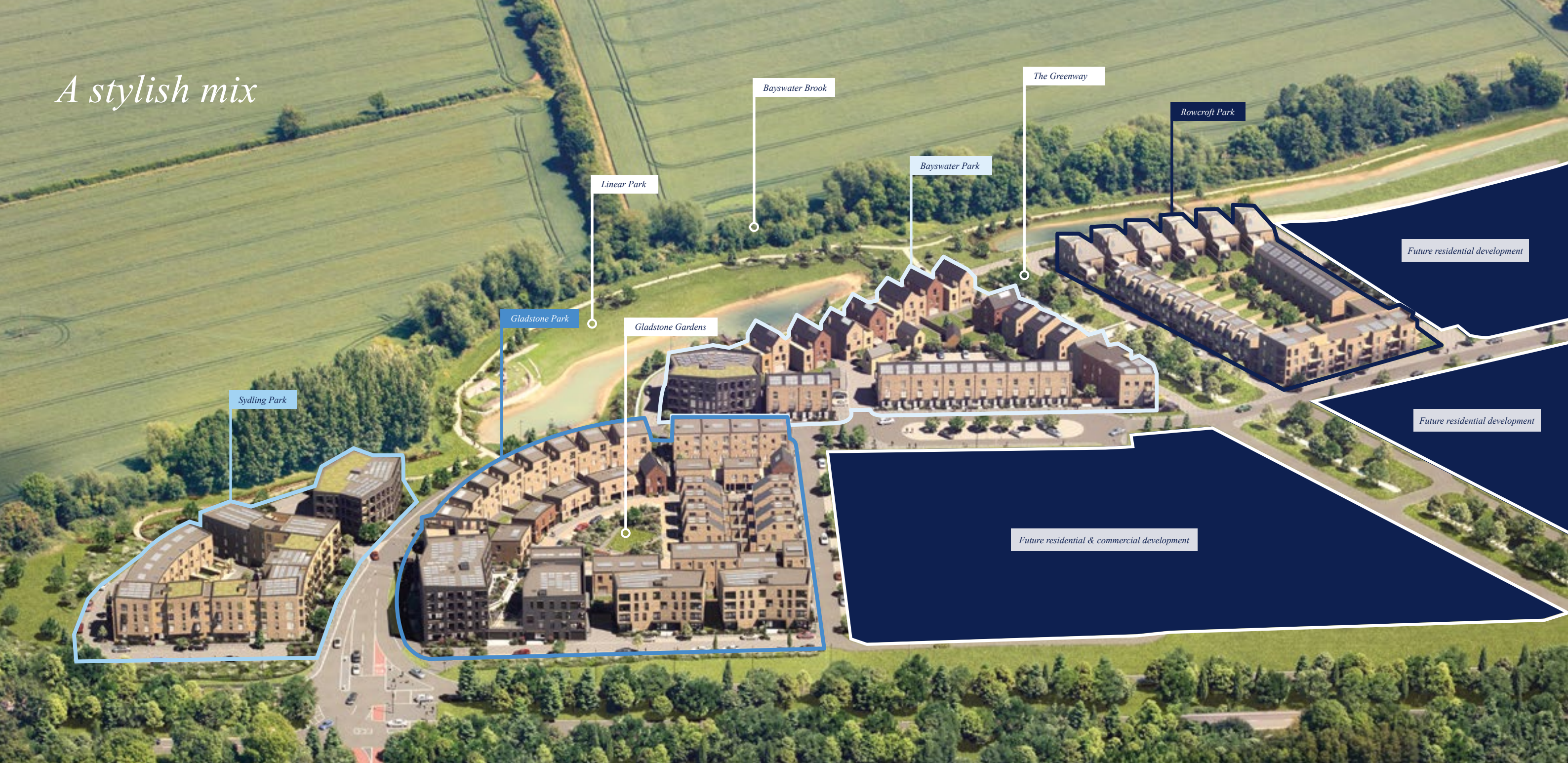
Computer Generated Image, aerial view of Mosaics

Four distinct and characterful areas, punctuated by welcoming green spaces and picturesque wooden walkways, come together to create Mosaics.