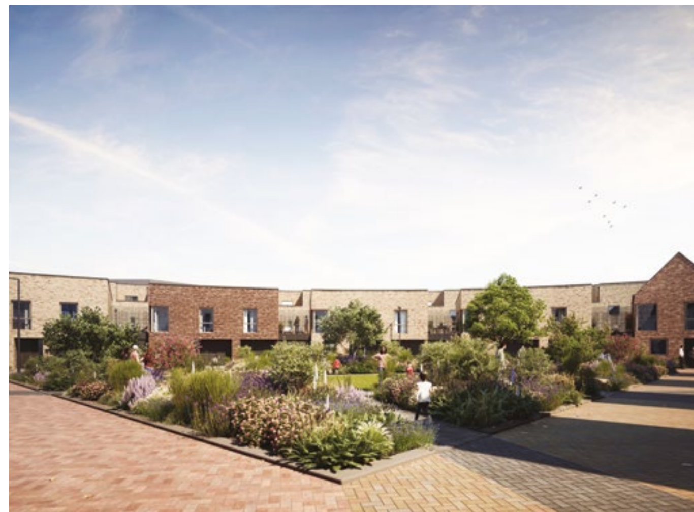
Computer Generated Image of Gladstone Gardens

The Greenway, with its wild planting and native trees, constitutes a natural continuation of the Bayswater Brook into the residential area, linking Bayswater Park and Rowcroft Park. Imaginatively created spaces, such as Gladstone Gardens, provide green views for the homes displayed around them and become social retreats that bring people together.