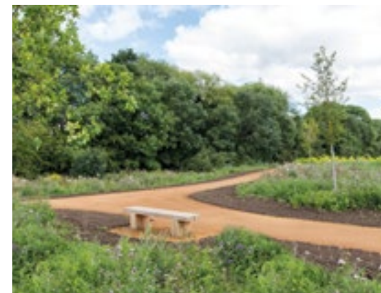
Photography of Bayswater Brook

Mosaics' architecture had been carefully considered to ensure that the new homes will be harmoniously integrated with the green settings of the development, enabling the residents to enjoy the great outdoors from their own doorstep.