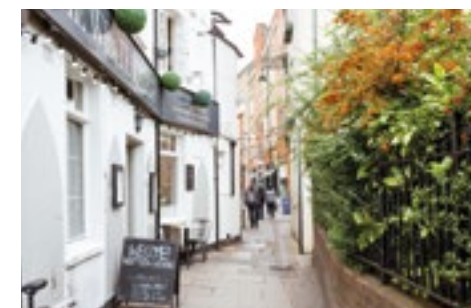
Little Clarendon Street

For those who choose to explore the city, Oxford provides unrivalled opportunities to spoil yourself – or somebody special.