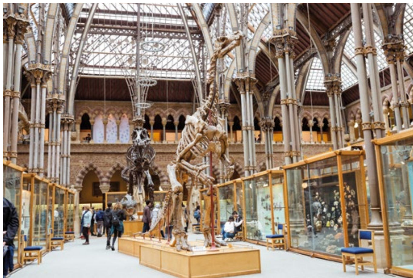
Oxford University Museum of Natural History