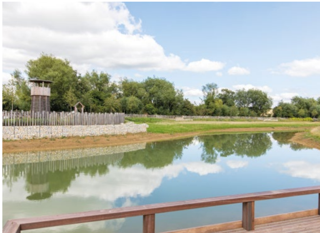
Photography of Linear Park