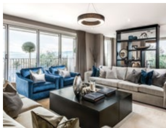
Photography of previous developments by Hill

Boasting full access to Mosaics' green spaces and communal areas, along with private gardens and allocated parking, these homes are the purest expression of our "best of both worlds" ethos.