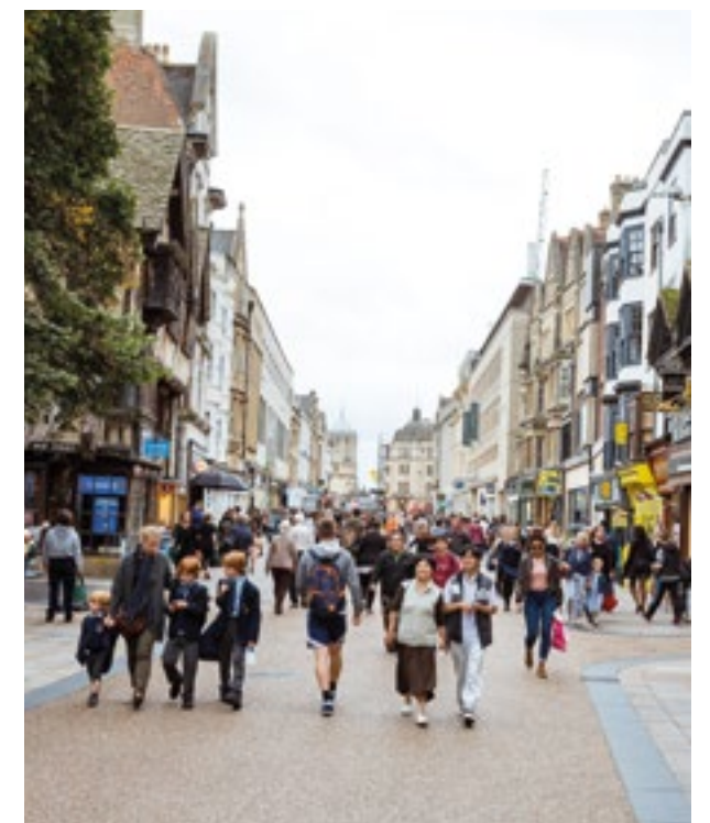
Bustling Cornmarket Street

From worldwide brands to local treasures, Oxford truly offers the best of both worlds.