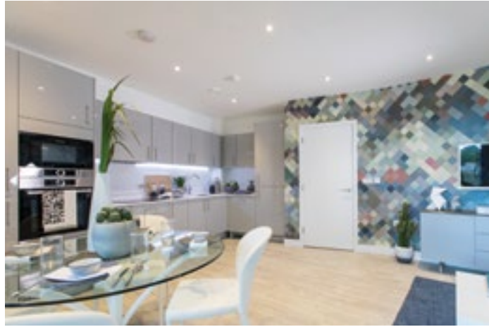
Photography of Mosaics show apartment