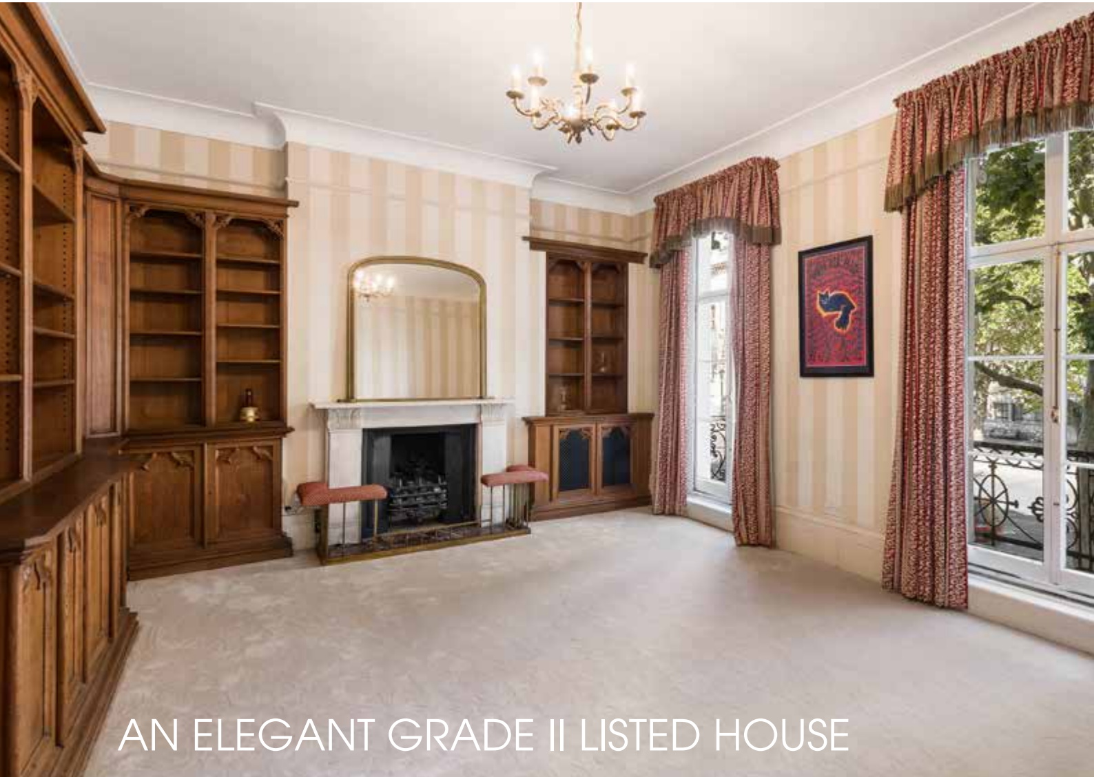
AN ELEGANT GRADE II LISTED HOUSE

The house comprises a dining room, shower room and kitchen on the lower ground floor with access out to the garden and a beautiful full depth reception room on the ground floor. The first floor comprises a sitting room / study with bedroom 2 looking over the garden at the rear and the top two floors include the principal suite with 2 further bedrooms above. With its privately enclosed south-facing garden, the property is perfectly equipped to make use of its space all year round, in addition there is a terraced area to the front of the house.