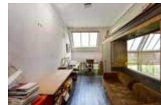
The three images below are from when the property was renovated in the 70s

workspace. The property further comprises an eat-in kitchen with a clerestory that brings in natural daylight, a study/library, 3 bedrooms, annex/ further bedroom, 1 bathroom and 2 guest toilets. Additionally the house comes with the added benefit of planning permission to replace and widen the entrance gate which would enable the residents to create a parking space within the courtyard. Planning reference number 16/08119/FULL