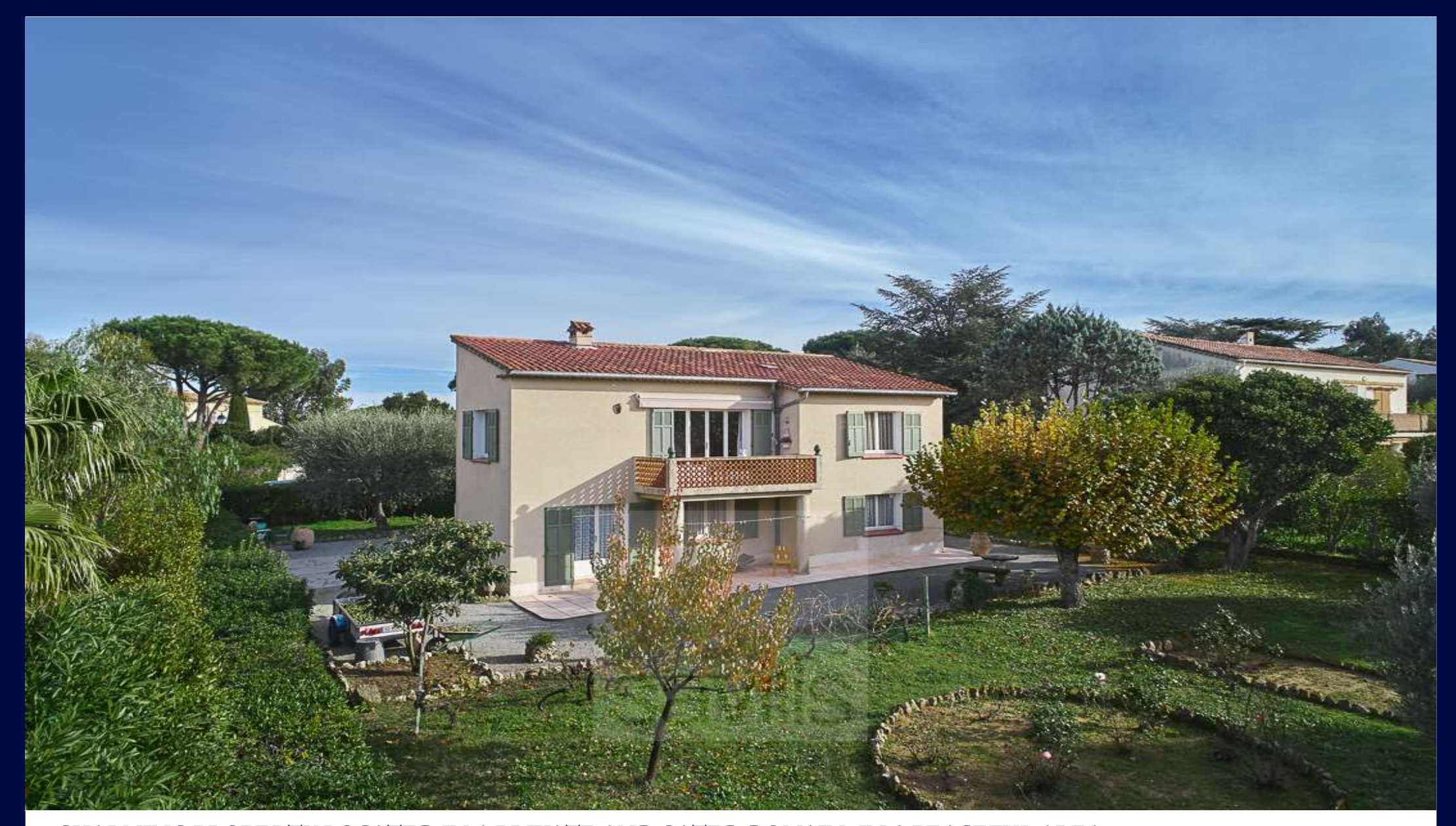
CHARMING PROPERTY LOCATED IN A PRIVATE AND GATED DOMAIN, IN A PEACEFUL AREA AND CLOSE TO THE CENTRE OF THE VILLAGE.

LES CARLES SAINT-TROPEZ, VAR COAST, FRENCH RIVIERA, 83990