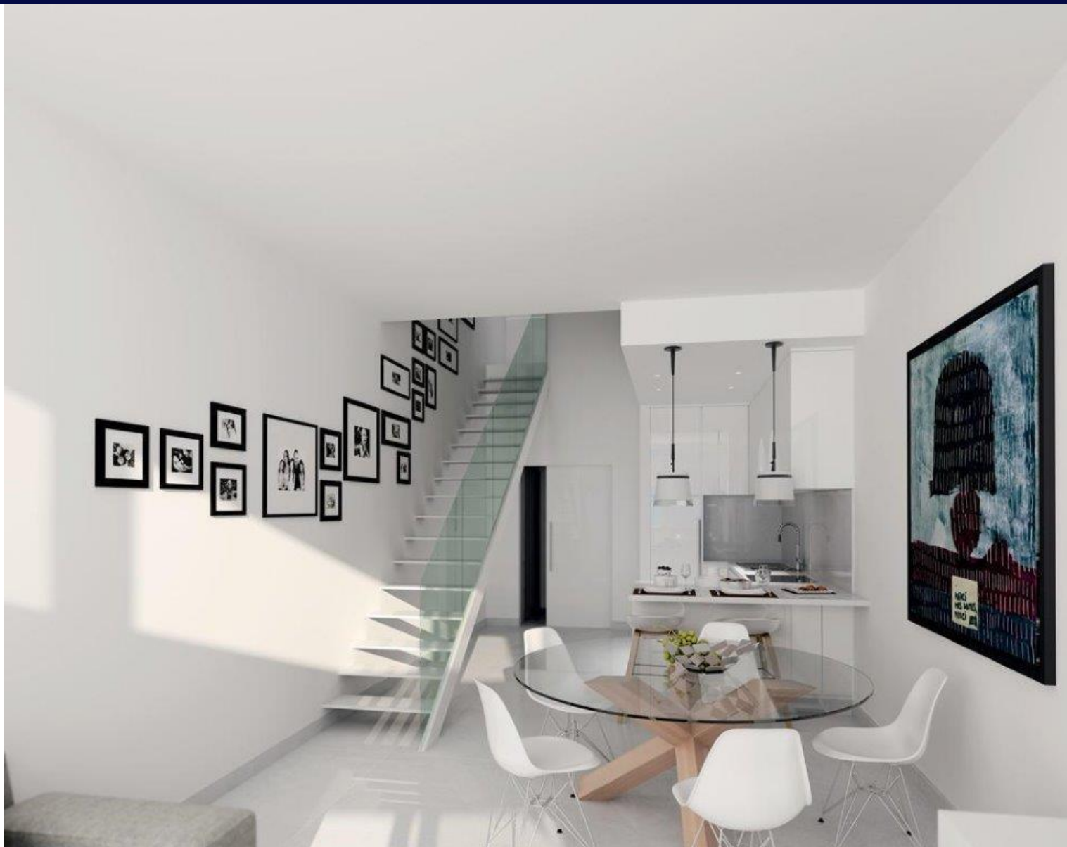
LA CONDAMINE 98000 MONACO Asking Price €4,060,000