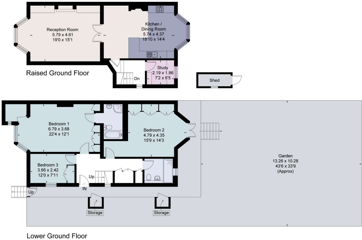
Surveyed and drawn in accordance with the International Property Measurement Standards (IPMS 2: Residential) fourwalls-group.com 250274