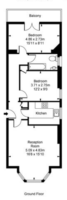
ILLUSTRATION FOR IDENTIFICATION PURPOSES ONLY

ALL MEASUREMENTS ARE MAXIMUM, AND INCLUDE WINDOW BAYS AND WARDROBES WHERE APPLICABLE THIS PLAN MUST NOT BE REPRODUCED BY ANY OTHER PERSON WITHOUT PERMISSION