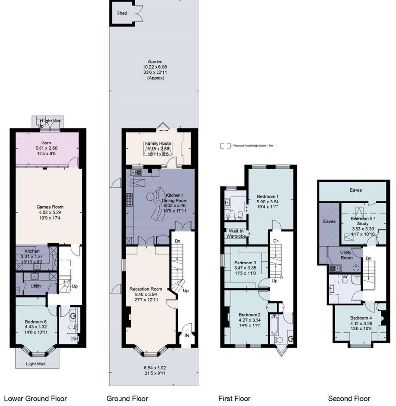
Surveyed and drawn in accordance with the International Property Measurement Standards (IPMS 2: Residential) fourwalls-group.com 285553