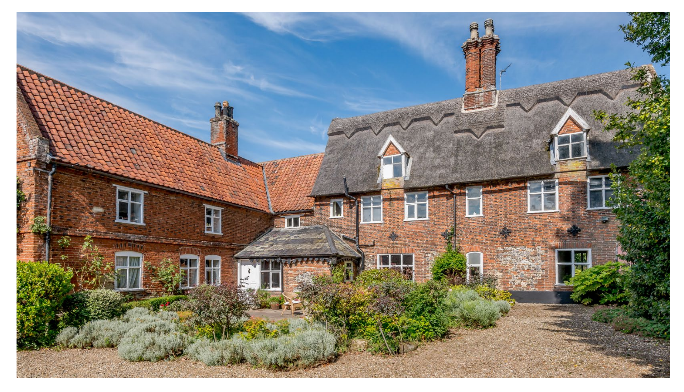
Picturesque Grade II listed 17th century manor house