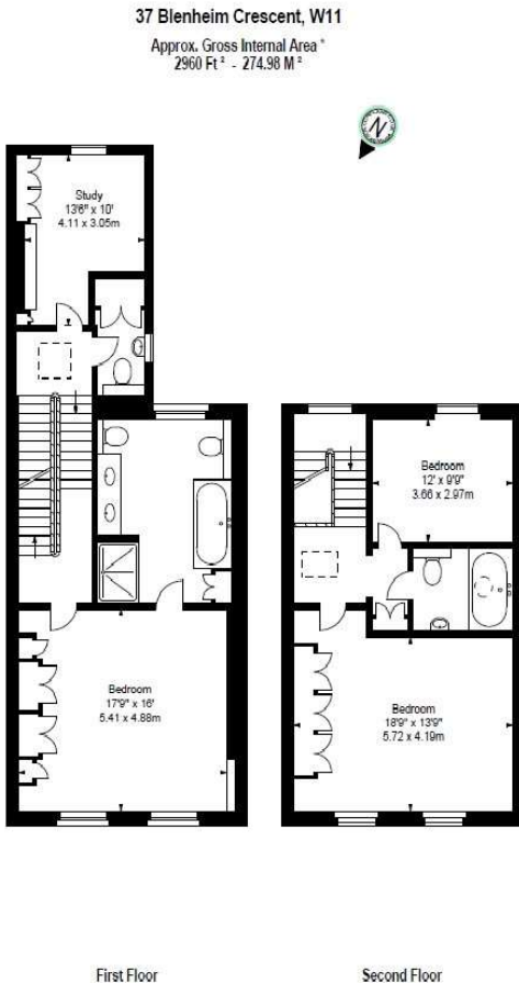
Illustration For Identification Purposes Only. Not to Scale * As Defined by RICS - Code of Measuring Practice