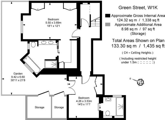
Lower Ground Floor Approximate Gross Internal Area 68.41 sq m / 736 sq ft