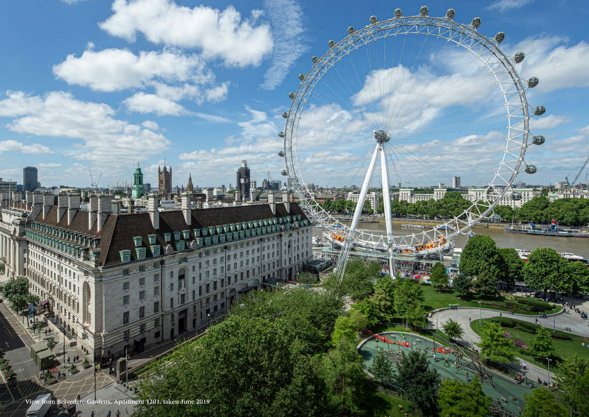
View from Belfry Gardens, Apartment 1201, taken June 2019