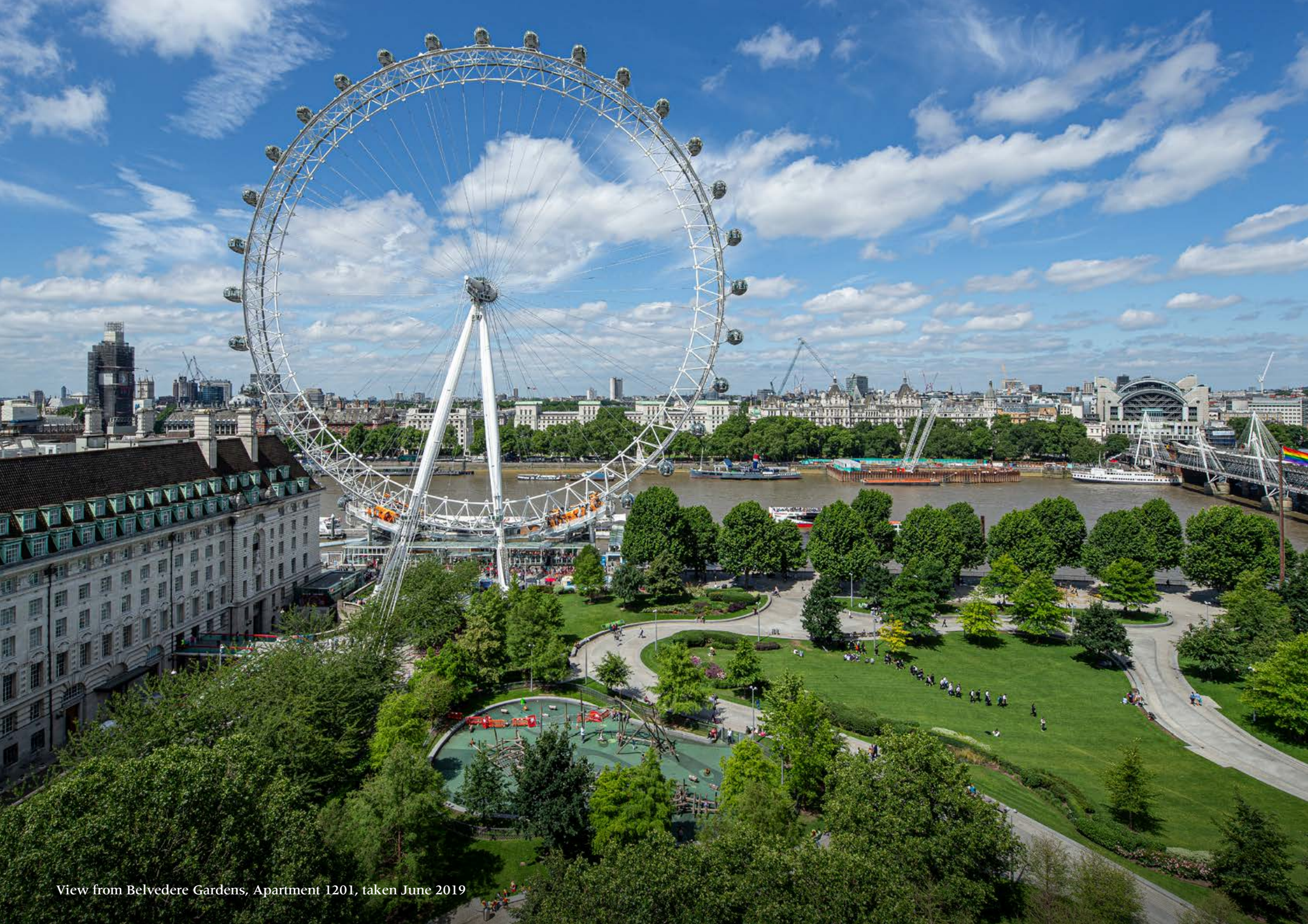
View from Belvedere Gardens, Apartment 1201, taken June 2019