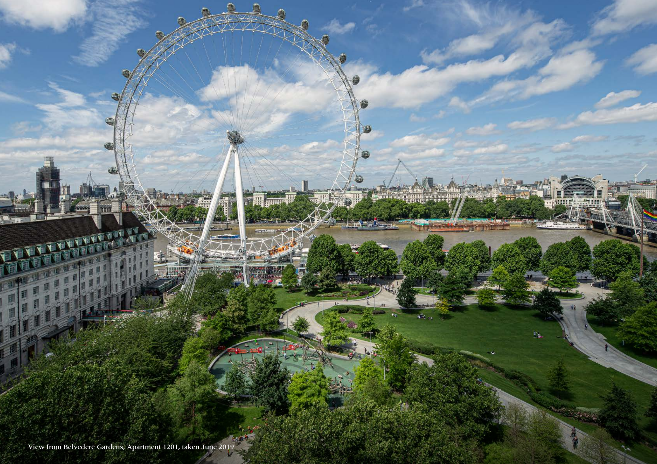
View from Belvedere Gardens, Apartment 1201, taken June 2019