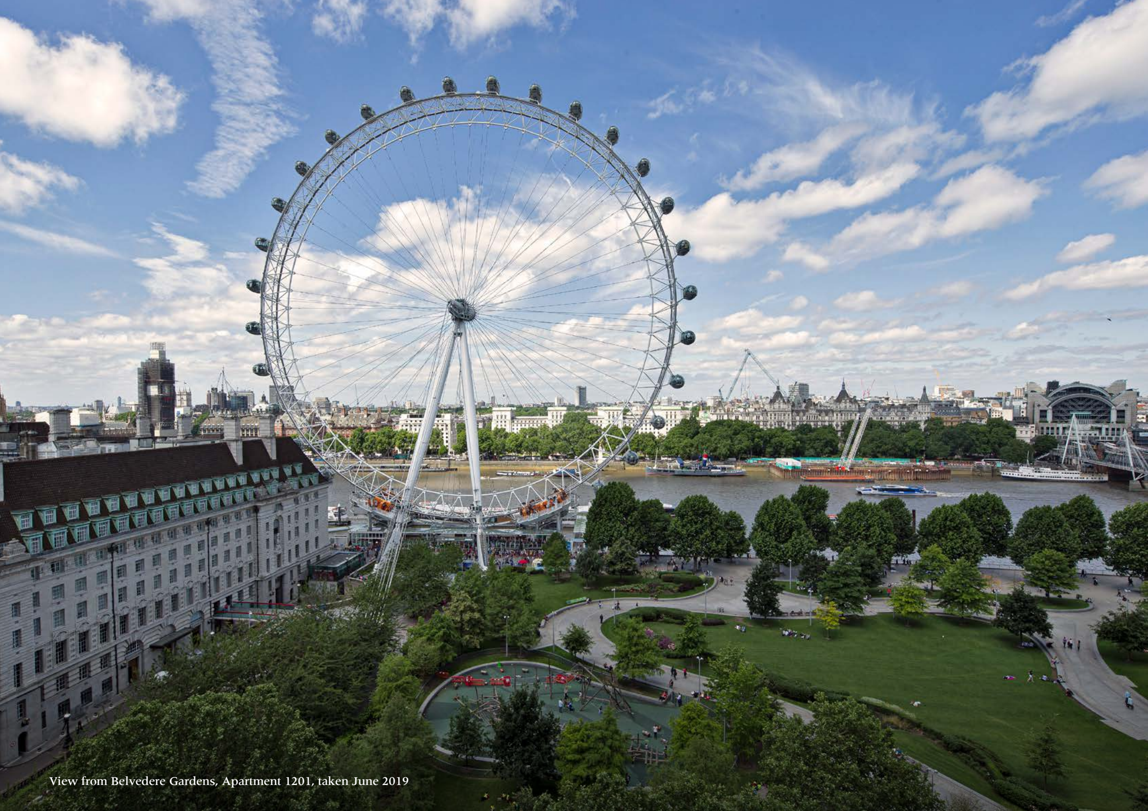
View from Belvedere Gardens, Apartment 1201, taken June 2019