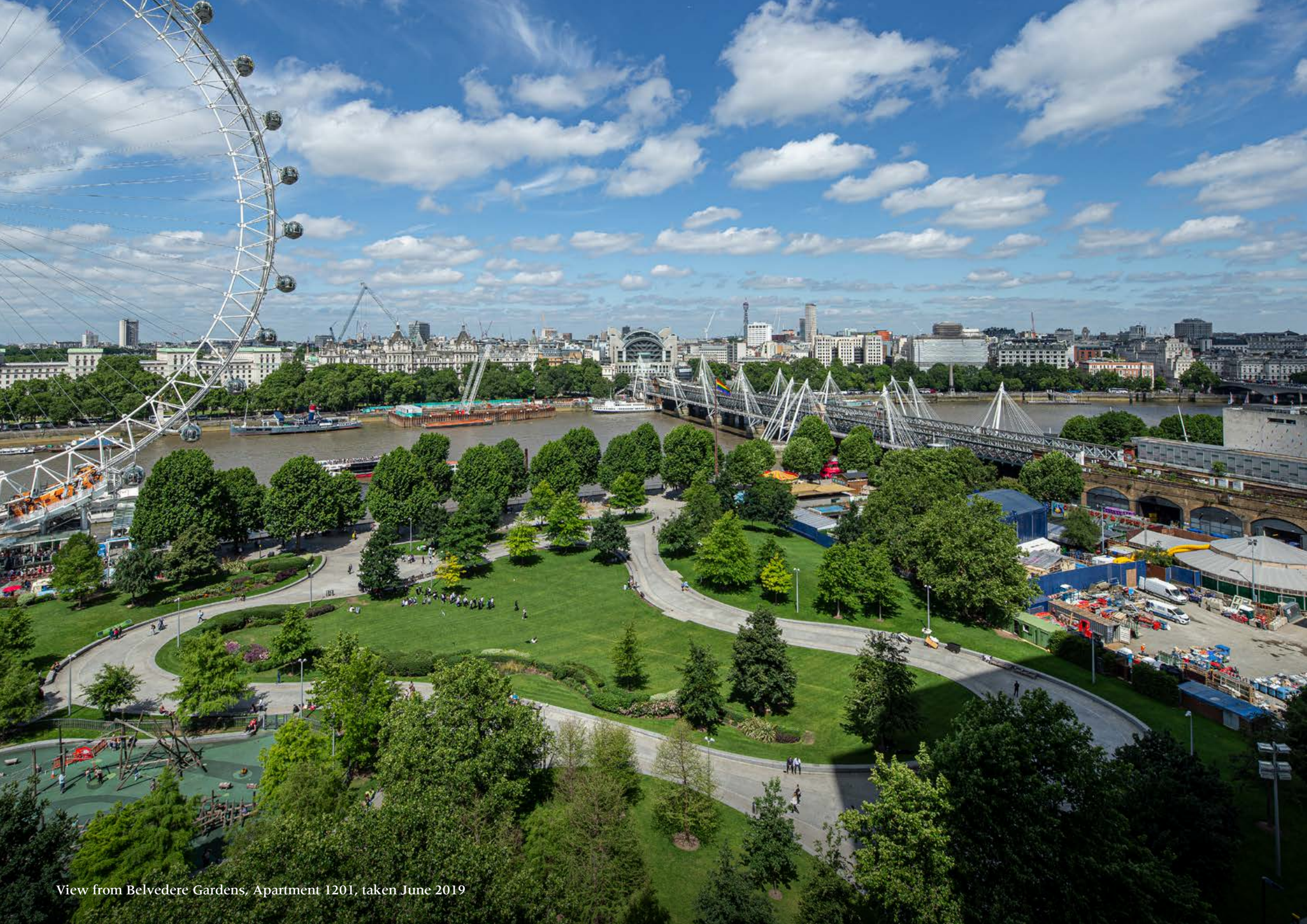
View from Belvedere Gardens, Apartment 1201, taken June 2019