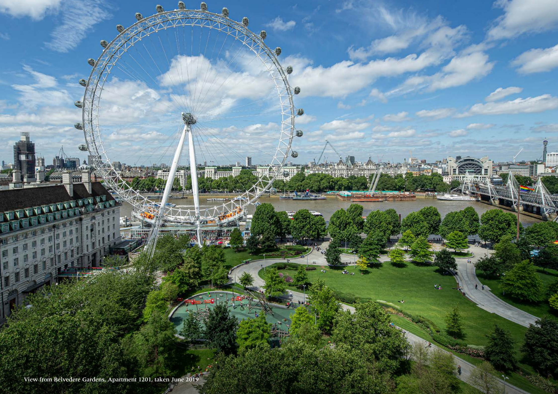
View from Belvedere Gardens, Apartment 1201, taken June 2019