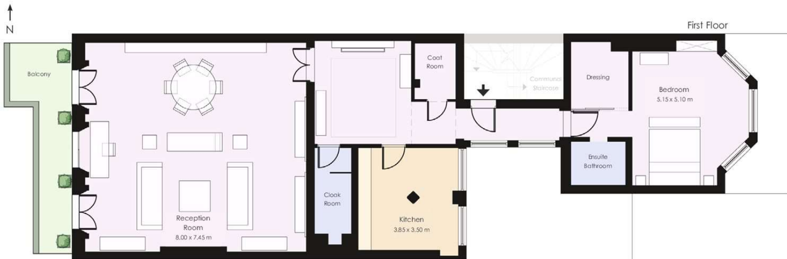
Illustration For Identification Purposes Only. Not To Scale