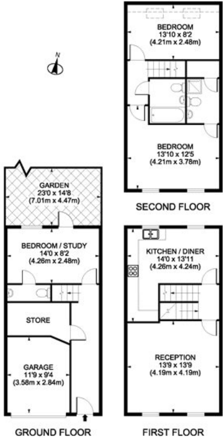
Clock Tower Mews, N1 Gross Internal Area 1029 sq ft/96 sq metres (plus garage 104 sq ft/10 sq metres)