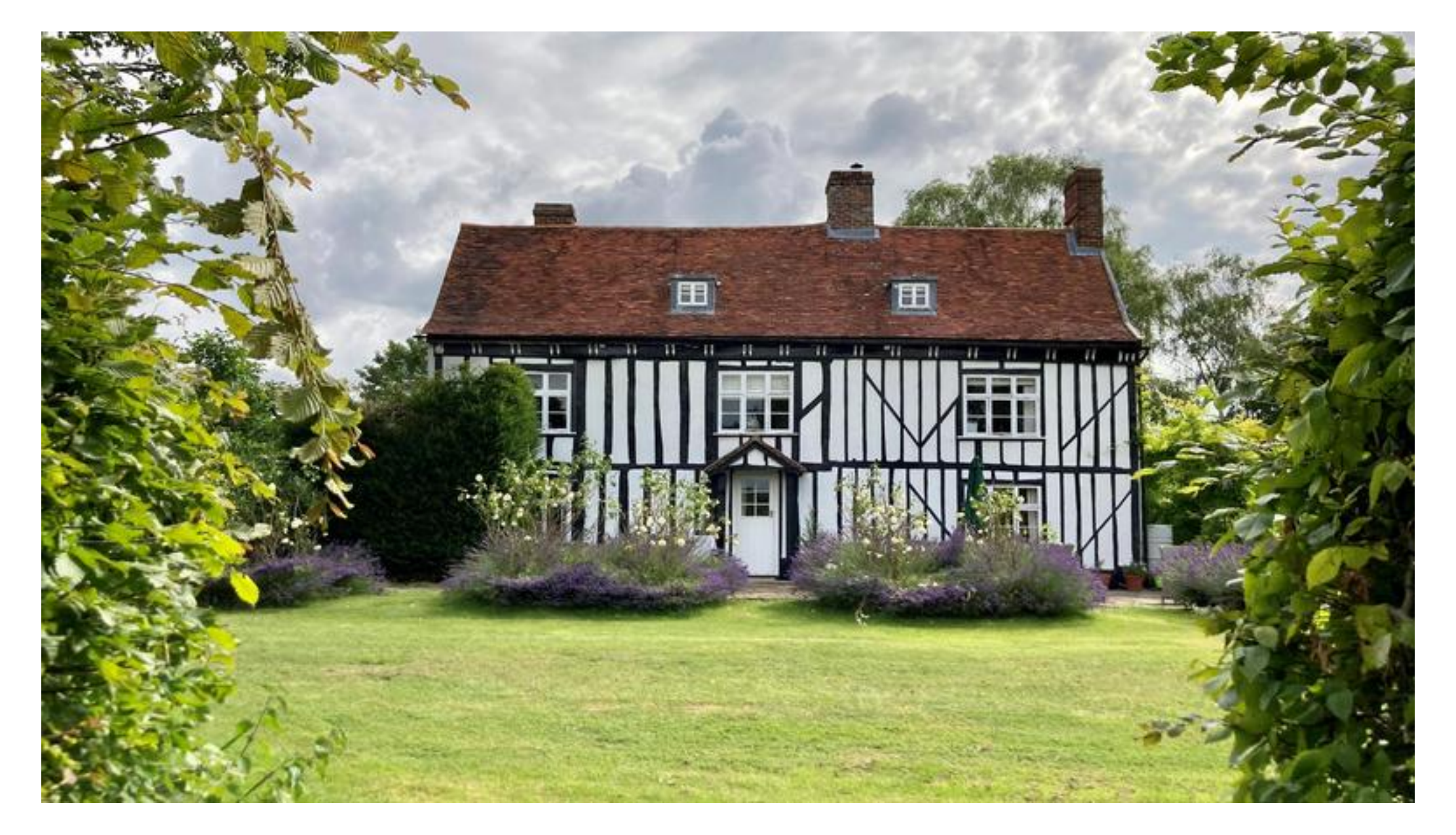
Secluded farm house with delightful gardens

Grove Farmhouse, Grove Lane, Little Wenham, Suffolk IP9 2LD