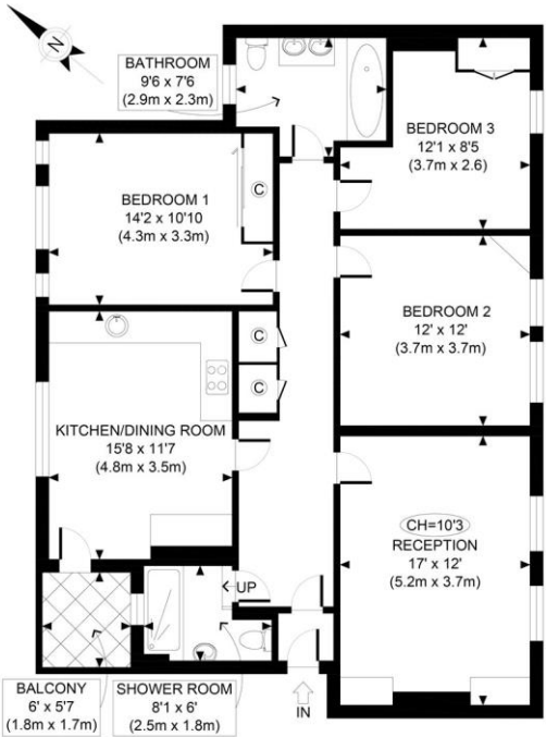
GROUND FLOOR GROSS INTERNAL FLOOR AREA 1121 SQ FT

Elgin Avenue, London, W9 Gross Internal Area 1121 sq ft, 104.1 m²