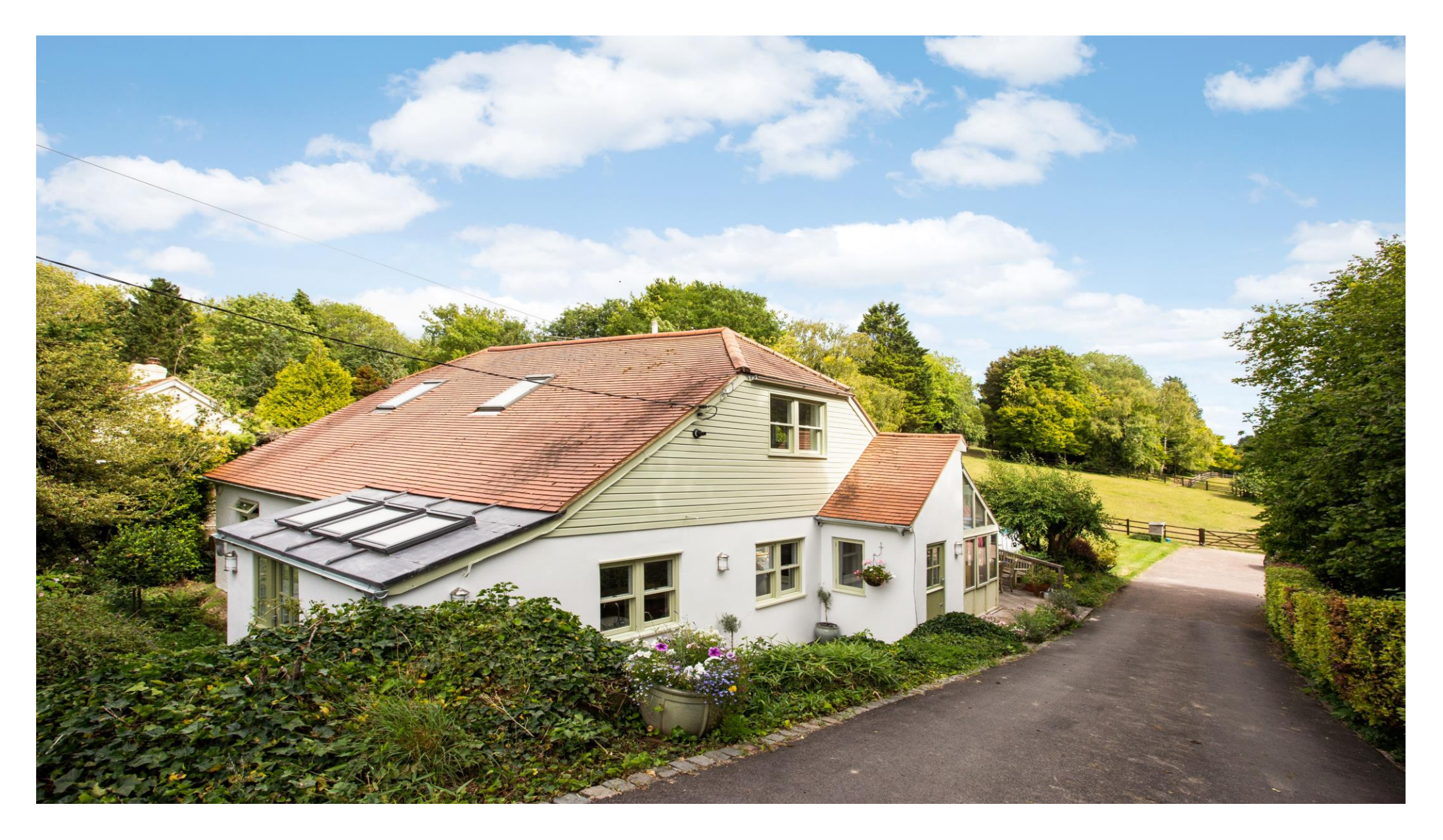
Detached house with equestrian facilities set in about 3.8 acres