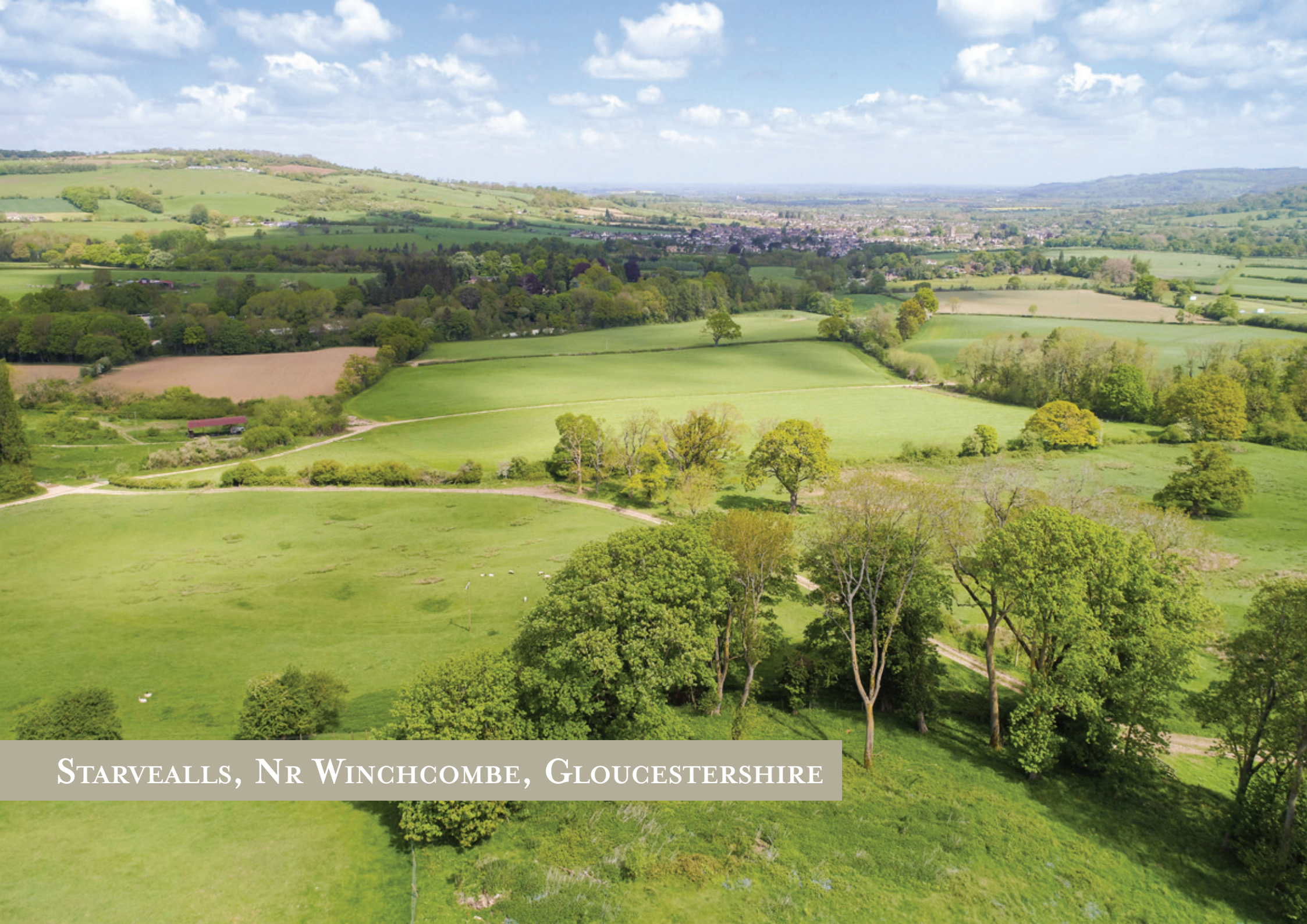
STARVEALLS, NR WINCHCOMBE, GLOUCESTERSHIRE