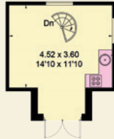
THE ALUM HOUSE - FIRST FLOOR