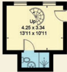
THE ALUM HOUSE - GROUND FLOOR (Not shown in actual location/orientation)

Approximate Gross Internal Area: Main House: 160.2 sq.m. / 1,724 sq.ft. Garage: 27.7 sq.m. / 298 sq.ft. Outbuilding (Annexe): 36.4 sq.m. / 392 sq.ft. Total: 224.3 sq.m. / 2,414 sq.ft.