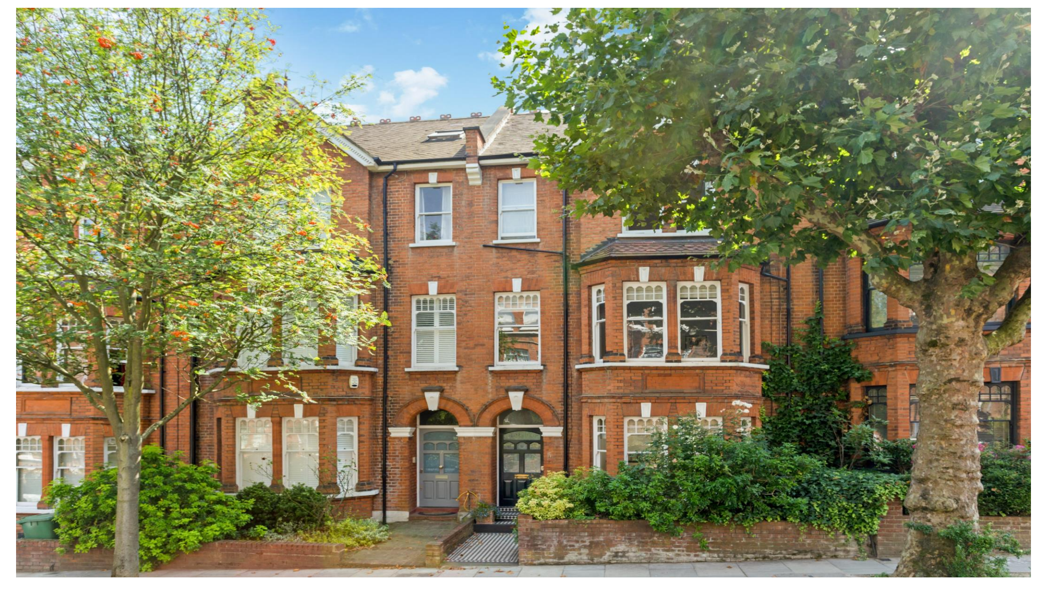
A very attractive Freehold family house, moments from Hampstead Heath

Heath Hurst Road, Hampstead, London, NW3