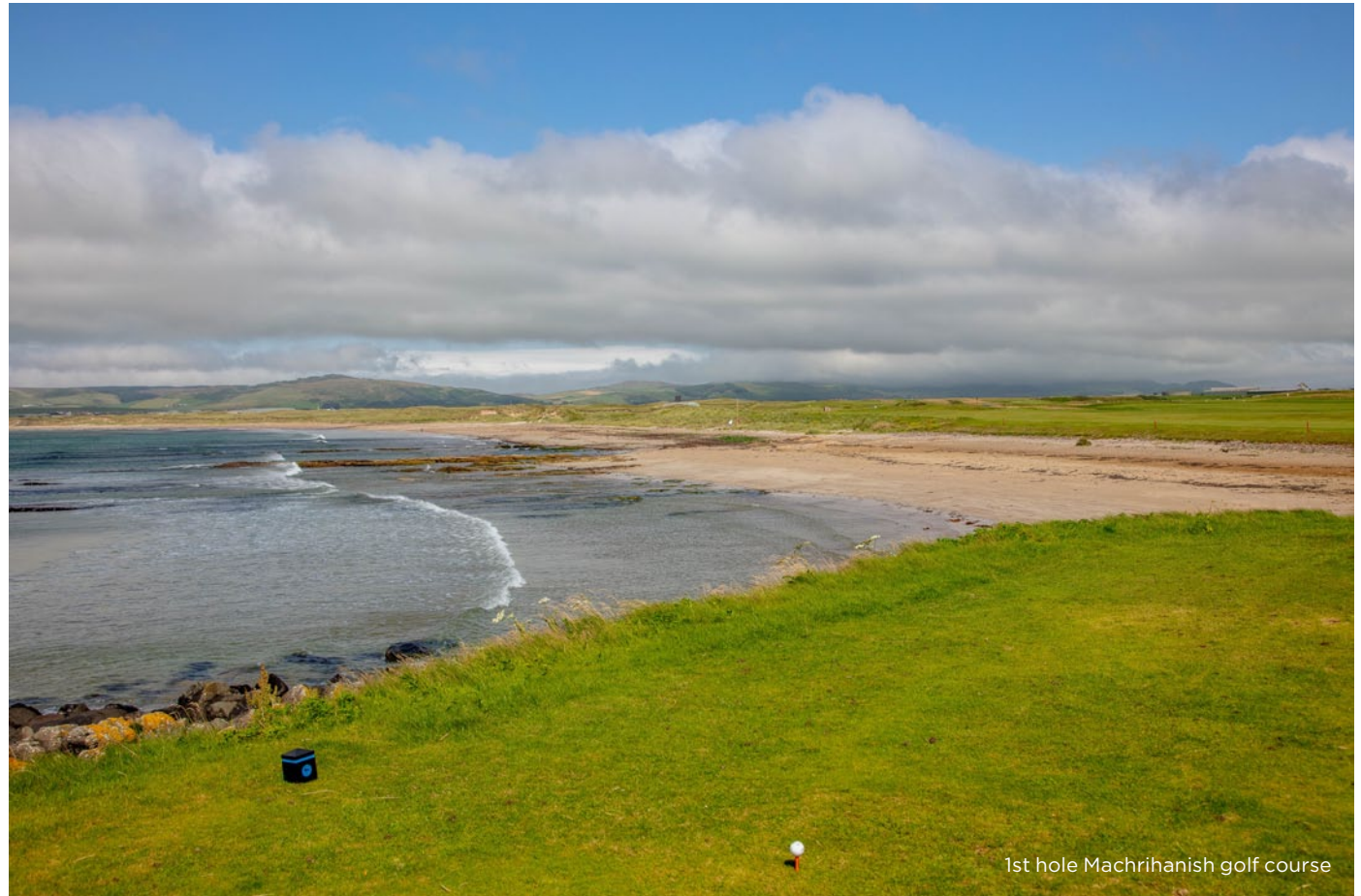
1st hole Machrihanish golf course

Within 7 days of the conclusion of Missives a deposit of 10% of the purchase price shall be paid. The deposit will be non-returnable in the event of the Purchaser(s) failing to complete the sale for reasons not attributable to the Seller or his agents