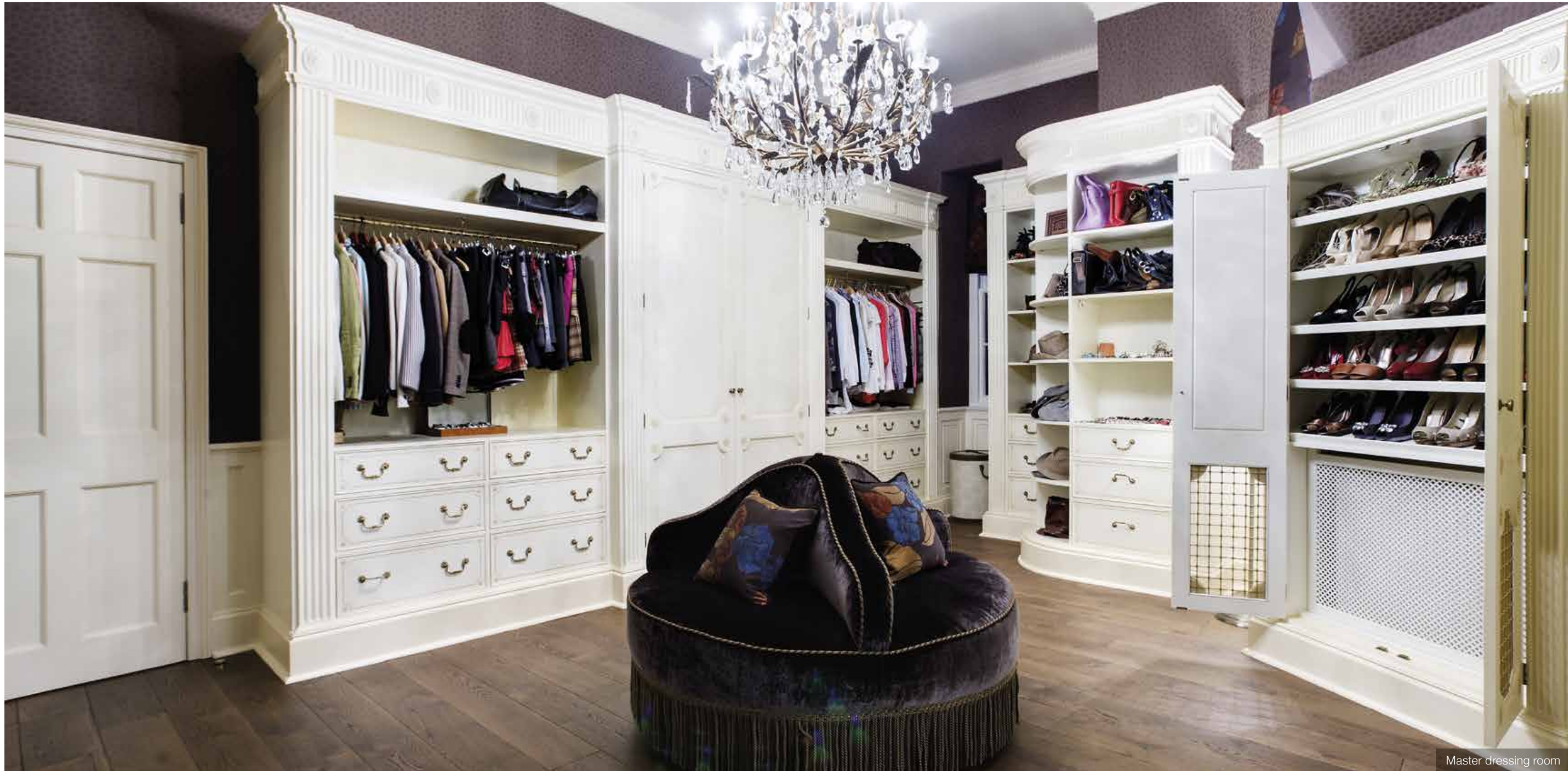
Master dressing room