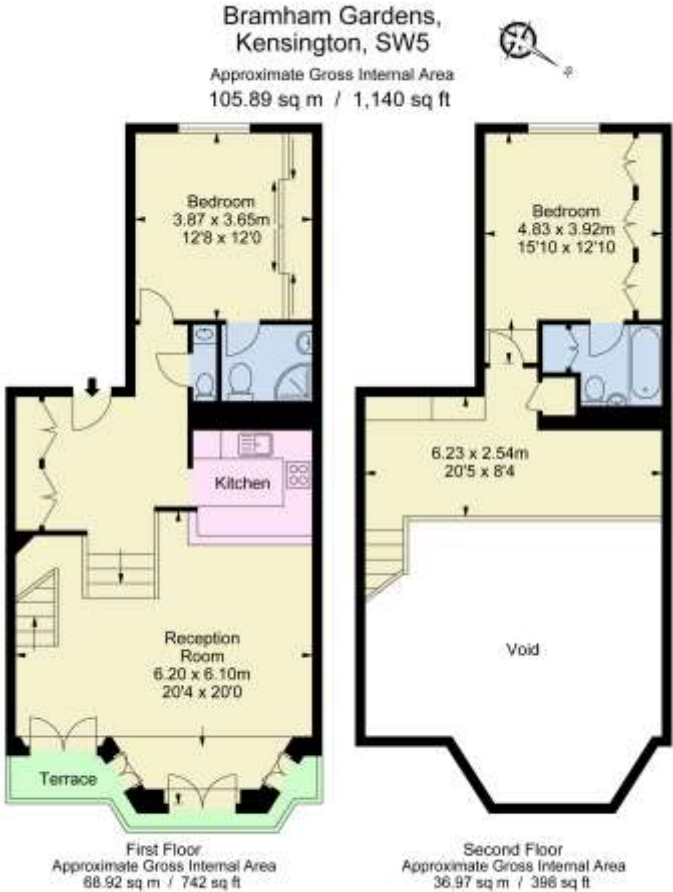
ILLUSTRATION FOR IDENTIFICATION PURPOSES ONLY ALL MEASUREMENTS ARE MAXIMUM AND INCLUDE WINDOW BAYS AND WARDROBES WHERE APPLICABLE THIS PLAN MUST NOT BE REPRODUCED BY ANY OTHER PERSON WITHOUT PERMISSION