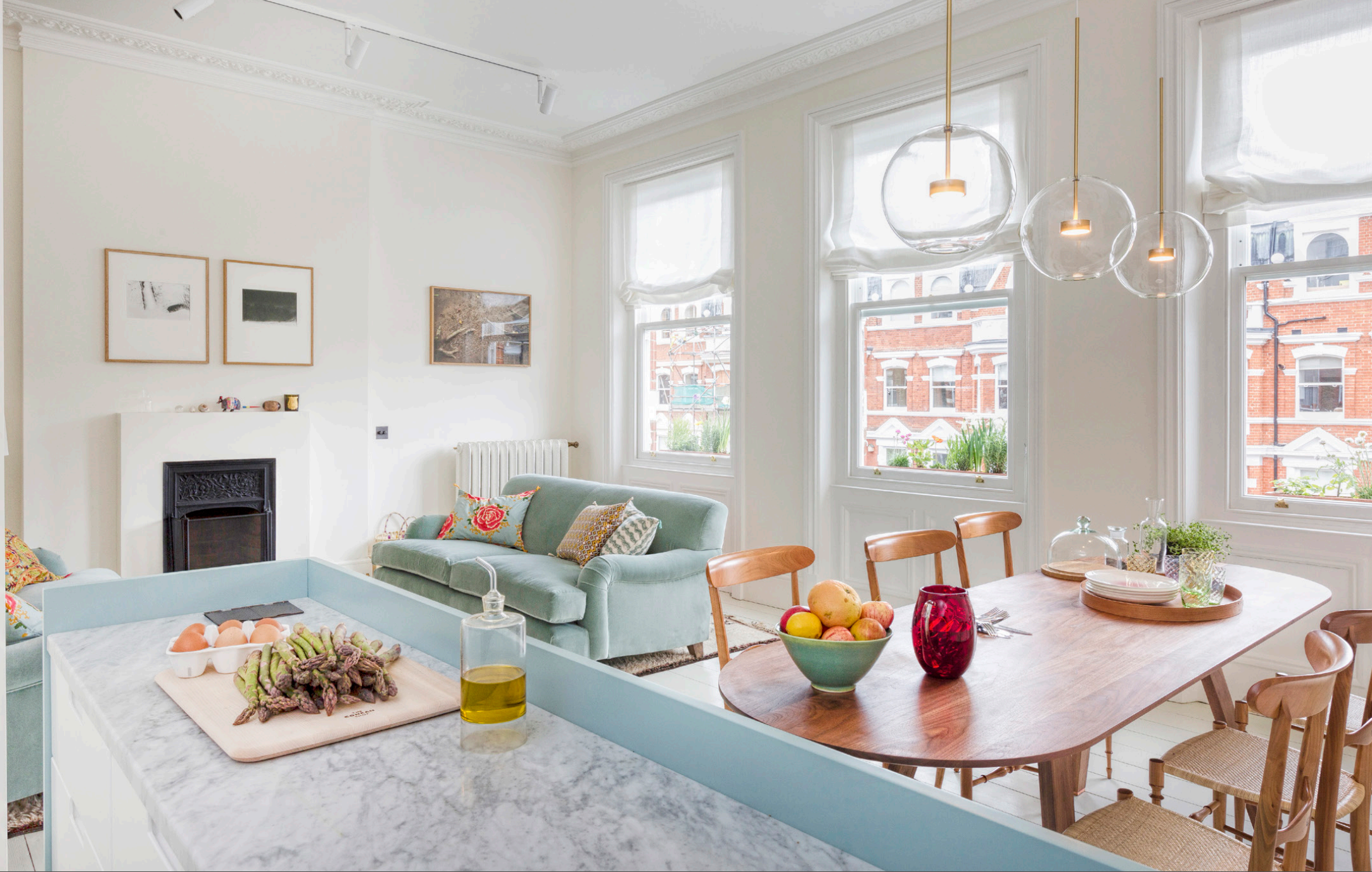
BRAMHAM GARDENS, SW5