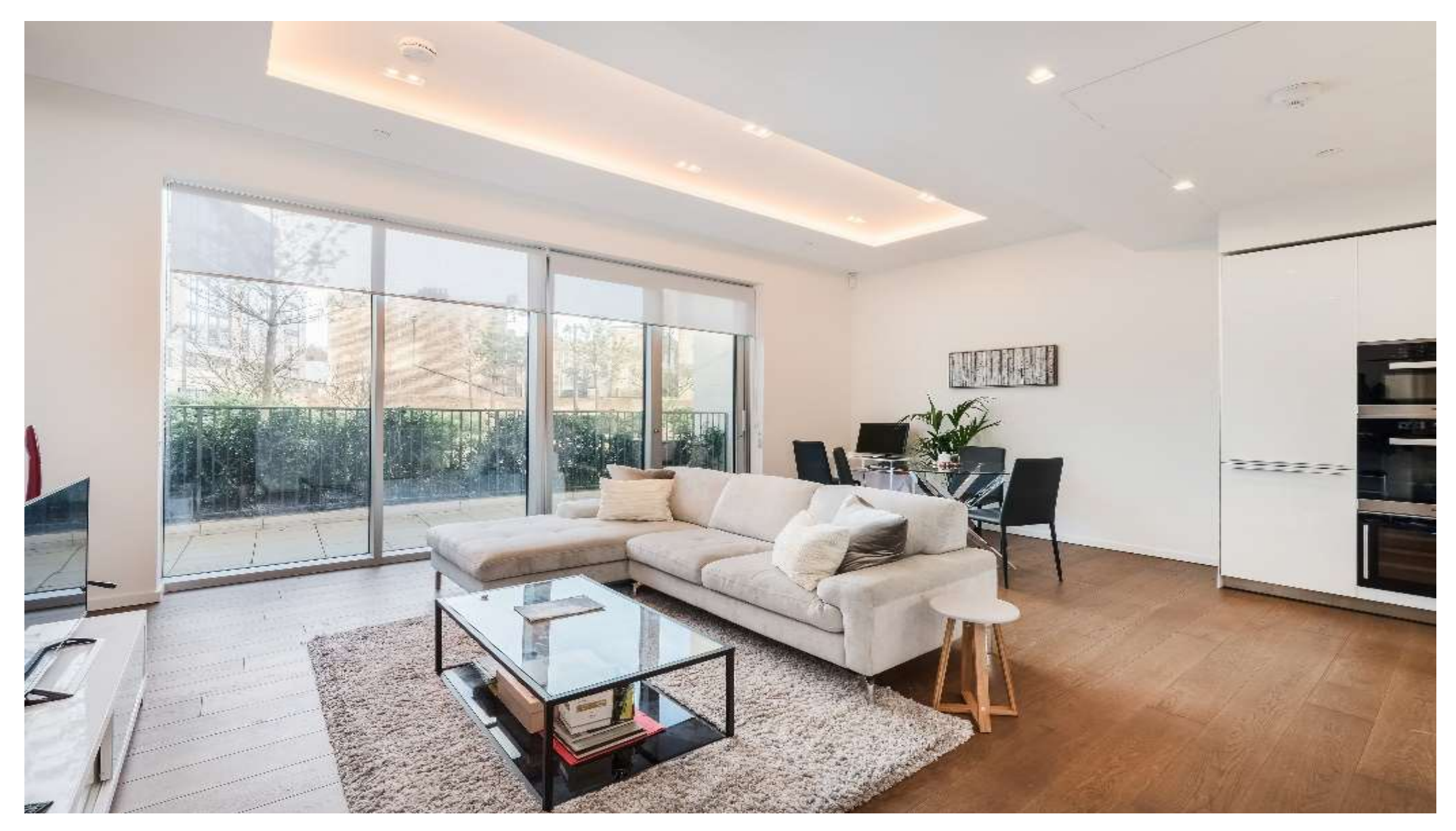
This is a wonderful two bedroom ground floor apartment with a private patio in an impressive new development. The development features a gym, a swimming pool and much more.