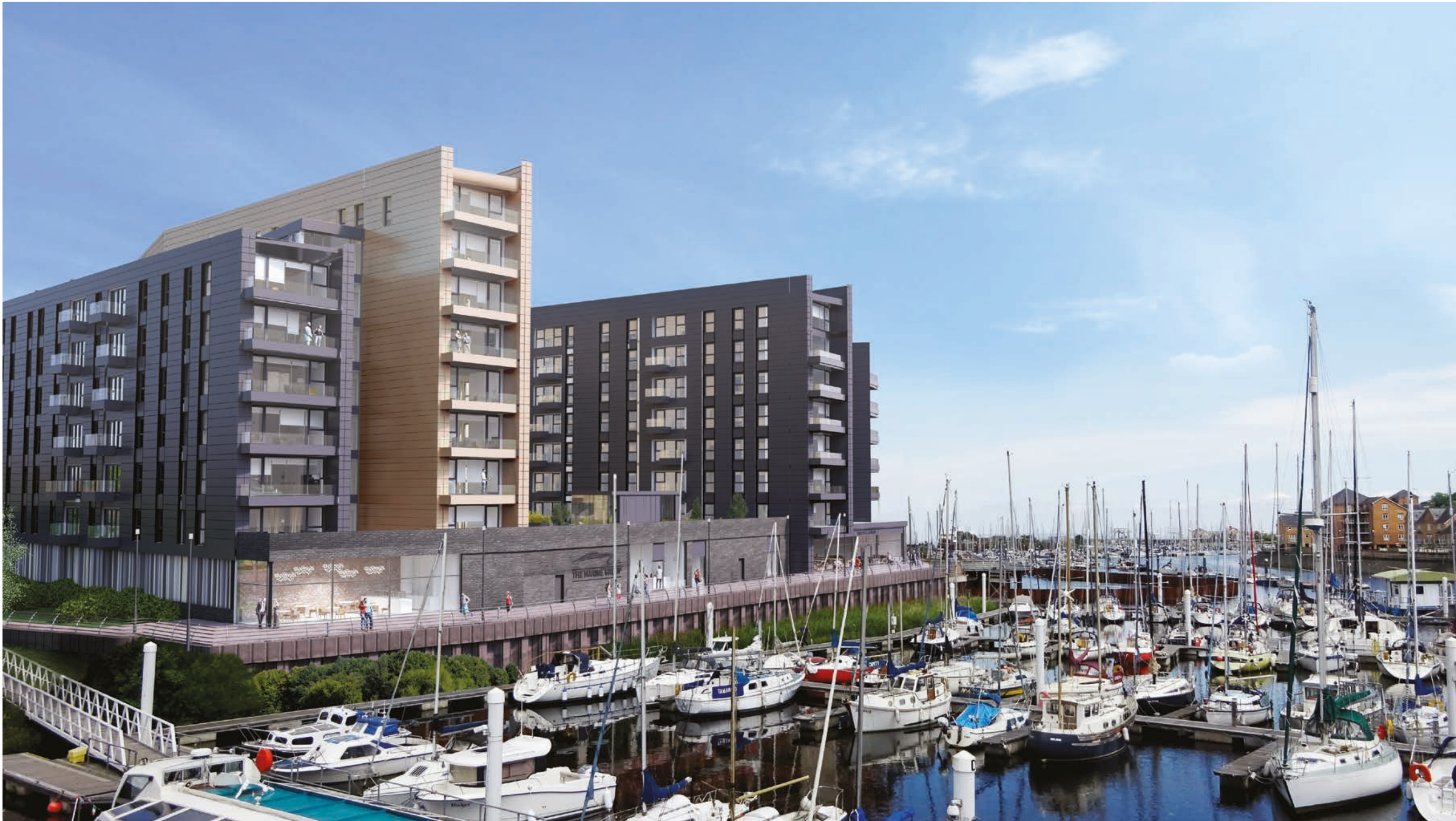
Computer generated image; details may change on completion.