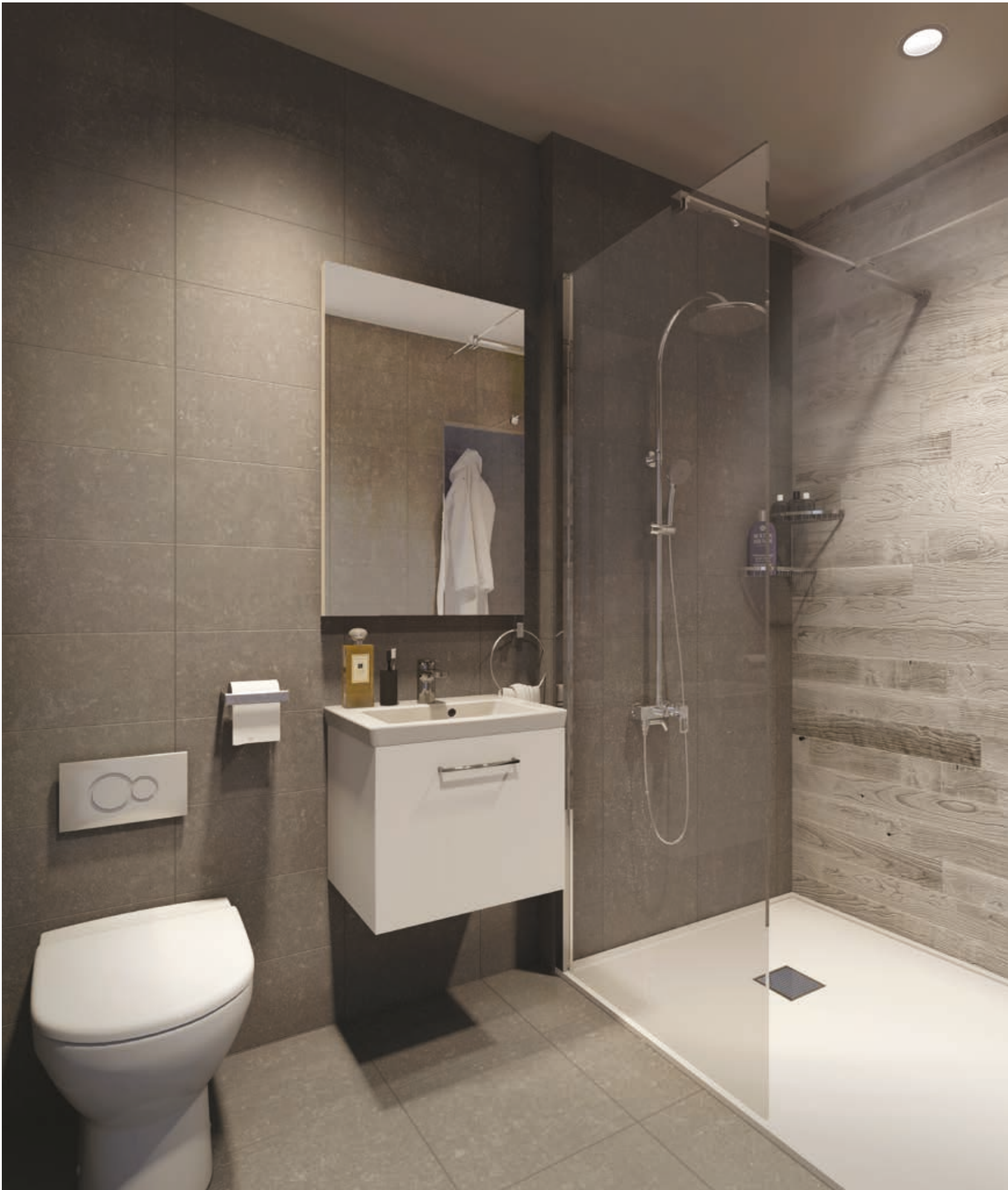
Computer generated image; details may change on completion.