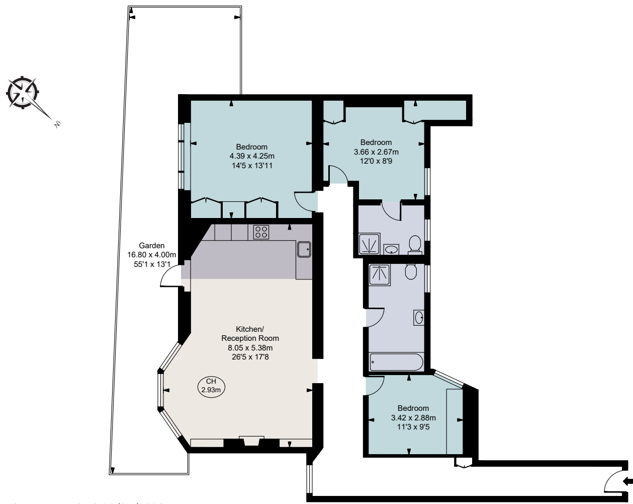
For identification only. Not to scale. © 22/05/2020

Approximate Gross Internal Area 128.48 sq m / 1,383 sq ft ( CH = Ceiling Heights )