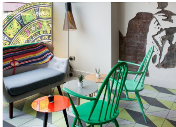
Previous interior style. Fixtures and fittings may differ from pictured.