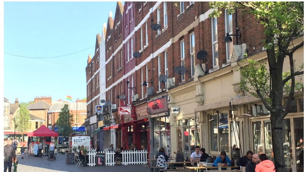
Photo of cafes and shops along Hildreth Street