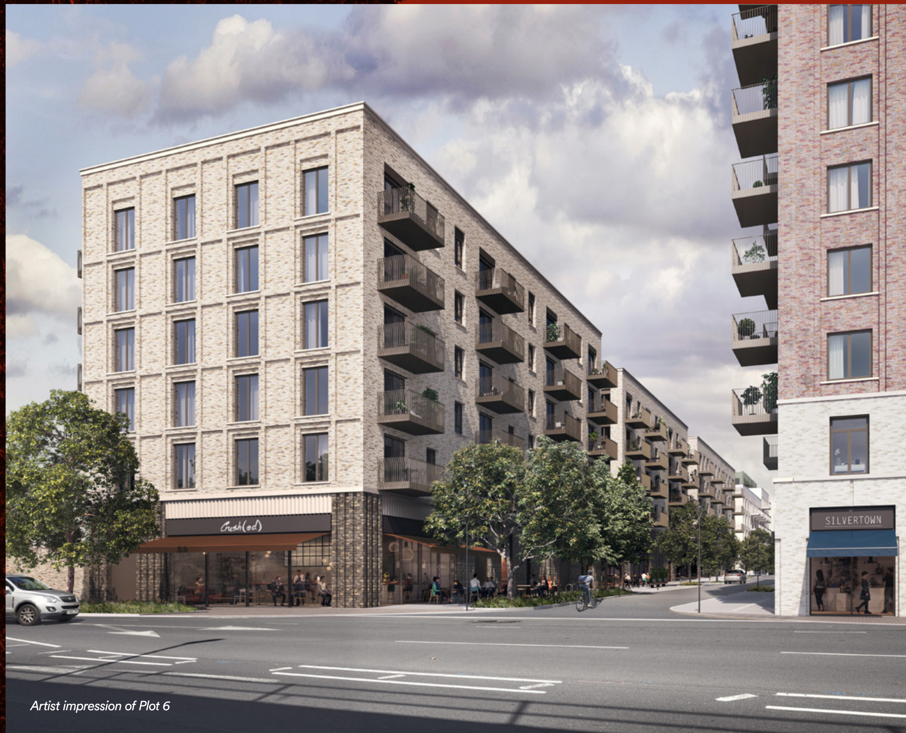
Artist impression of Plot 6

Silvertown was built in the 1860s for global trade. And today the iconic mills and deep waters of this dockland neighbourhood are reawakening. In a transformation that will see the rise of a new town centre just 15 minutes from central London.