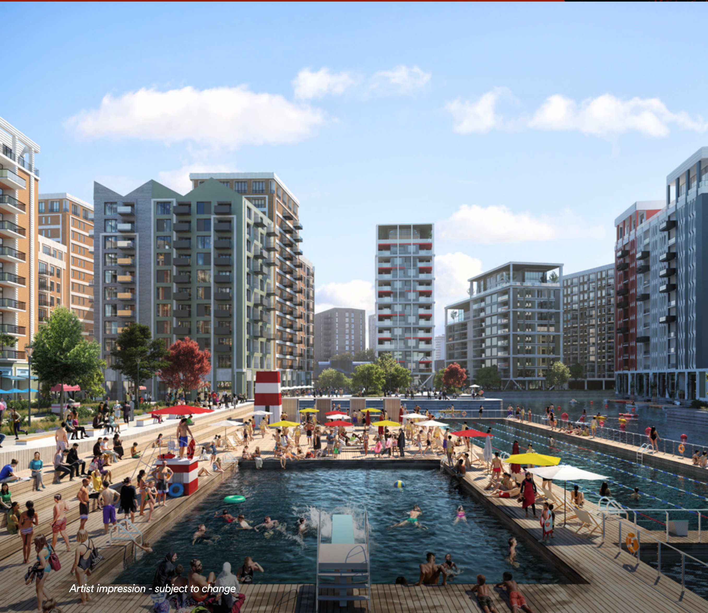
Artist impression - subject to change