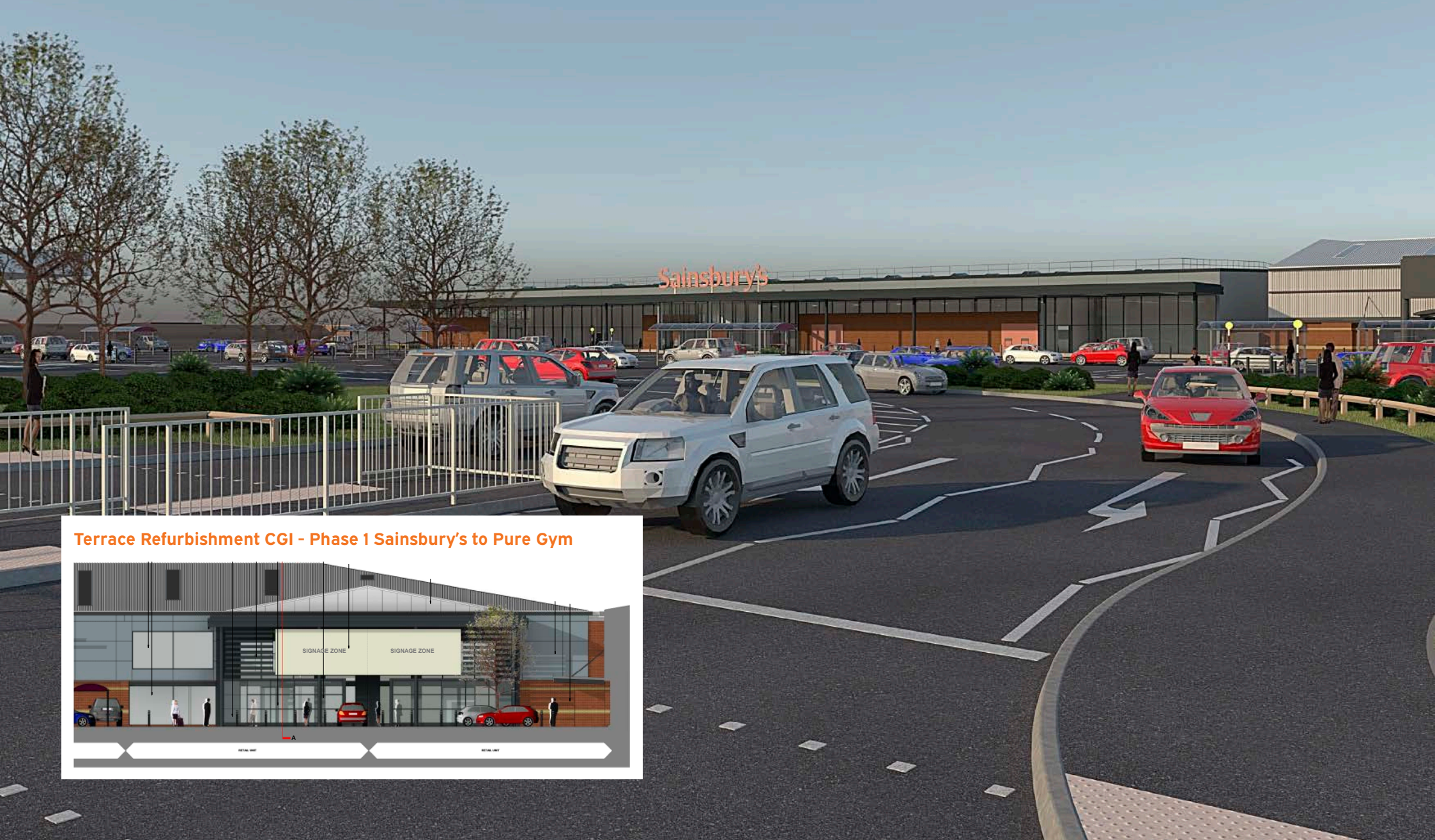
Terrace Refurbishment CGI - Phase 1 Sainsbury's to Pure Gym