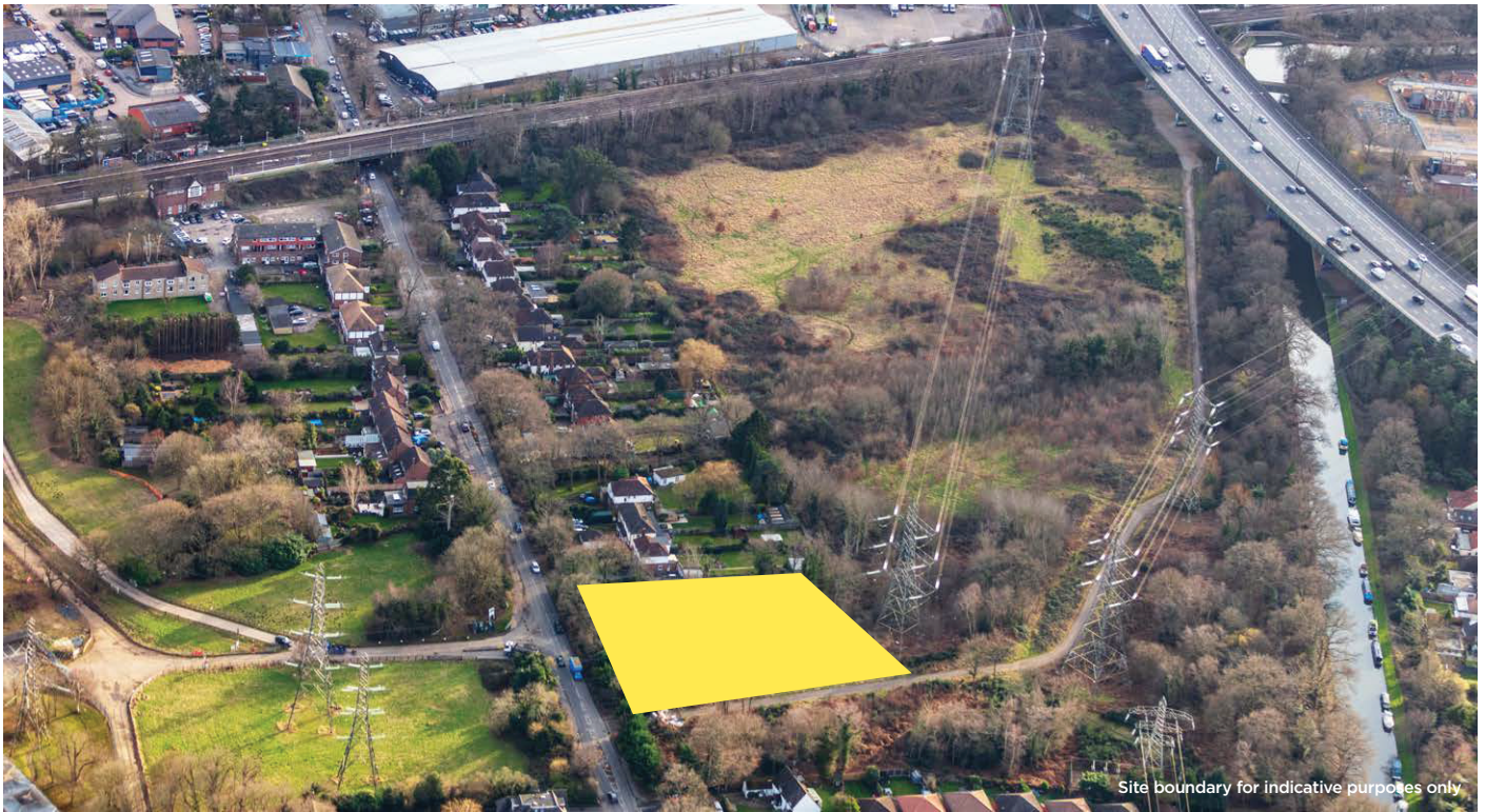
Site boundary for indicative purposes only