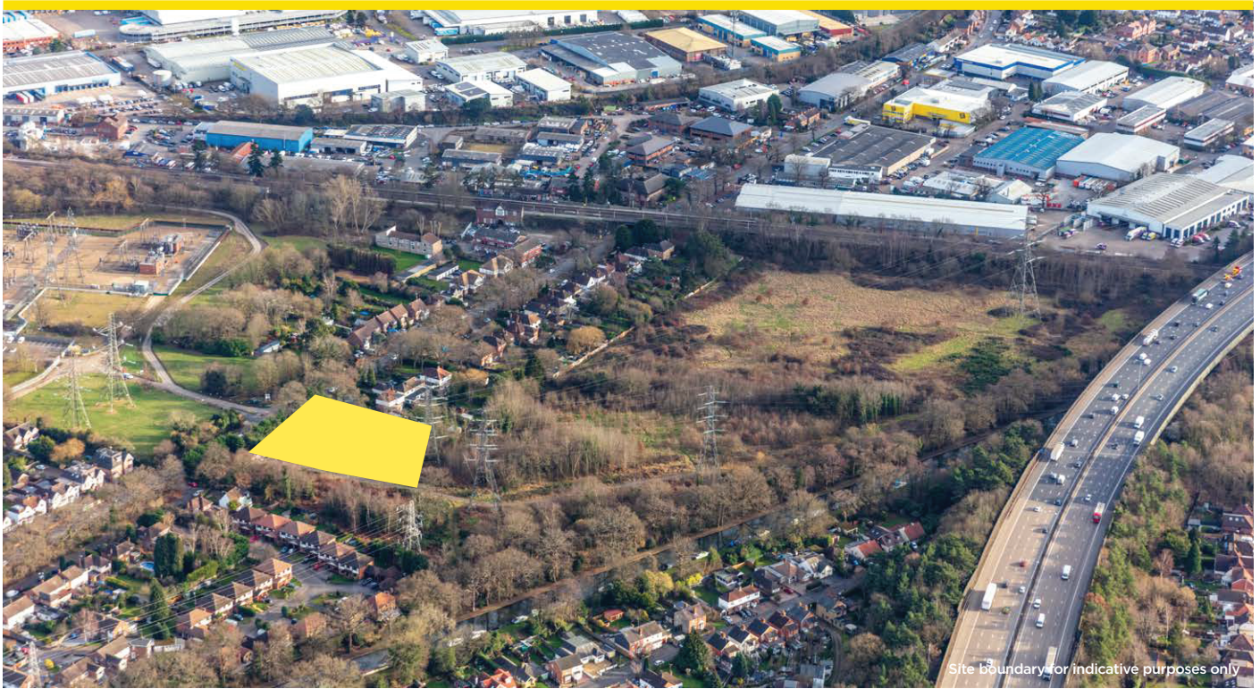
Site boundary for indicative purposes only