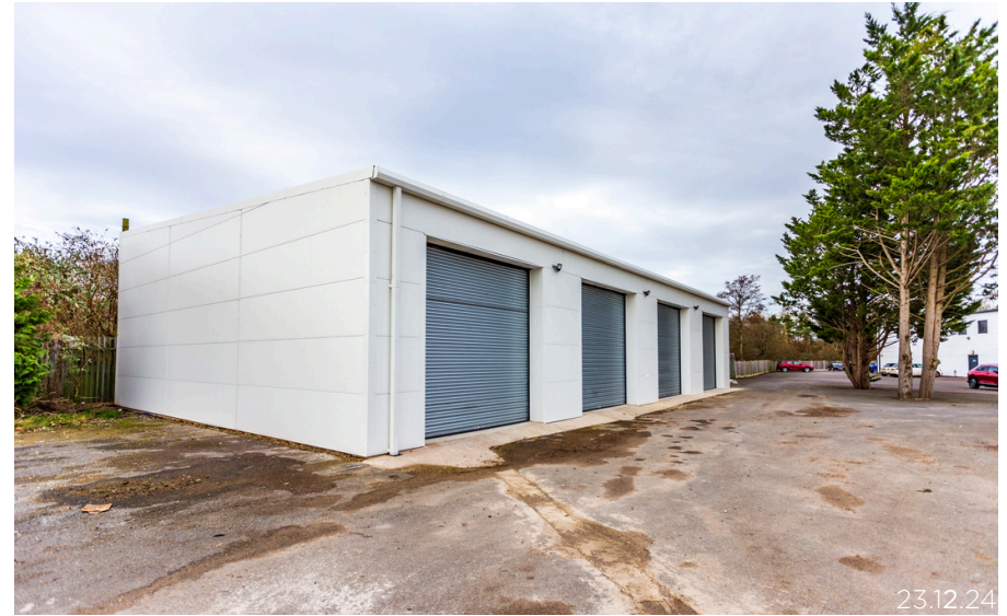
Building B - Detached workbays