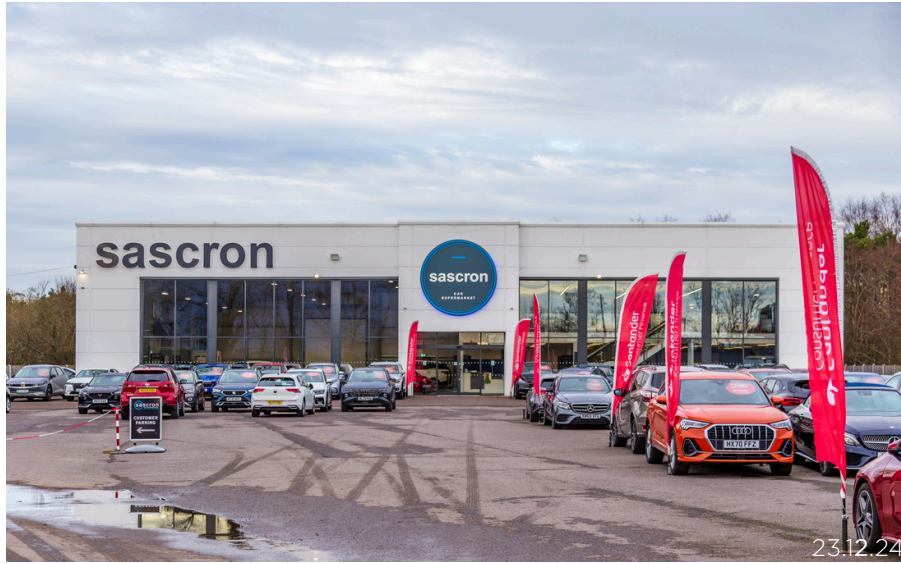
Building A - Showroom