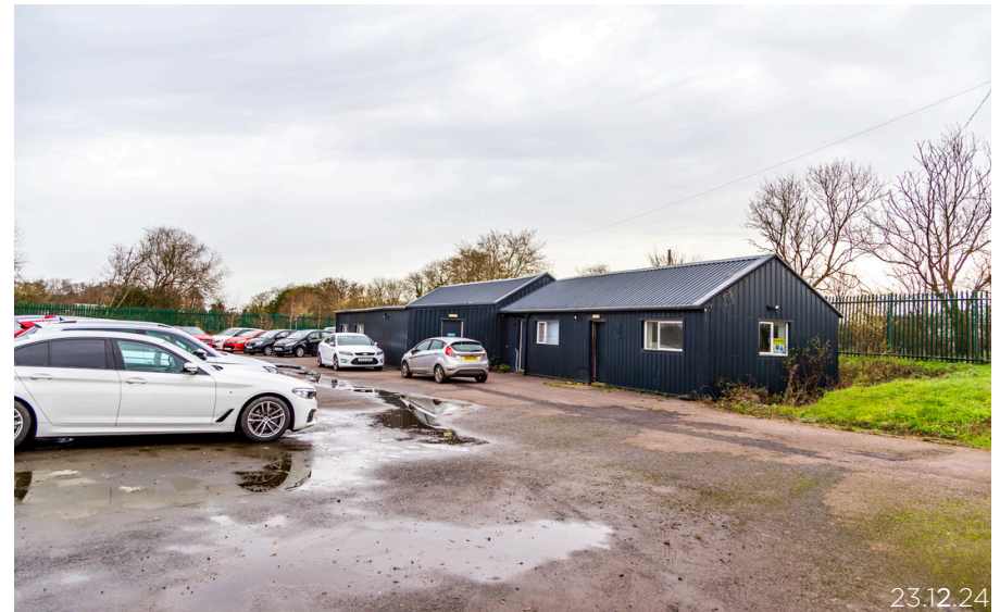
Building D - Security/staff accommodation