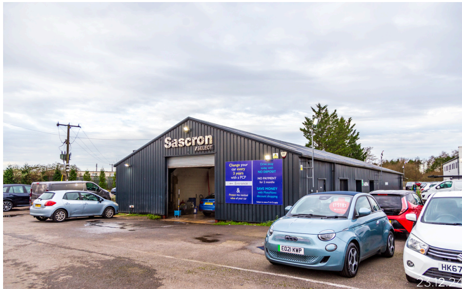
Building C - Detached workshop