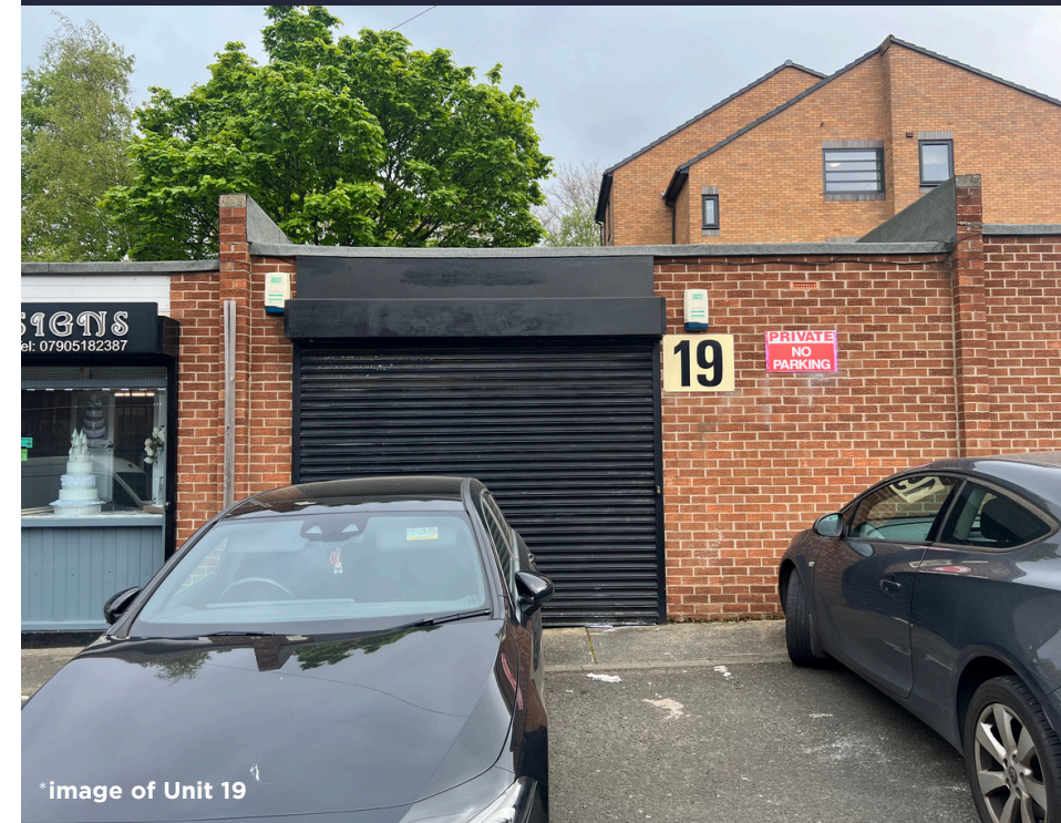
*image of Unit 19

We understand the properties benefit from gas, water and electric connection.