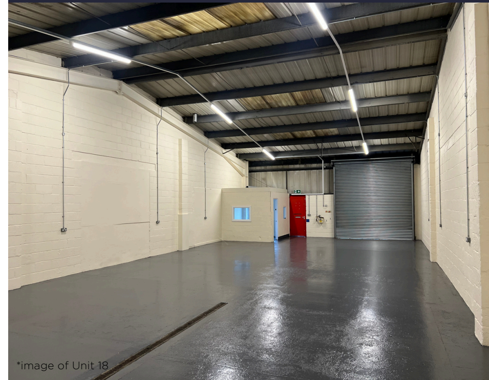
*image of Unit 18

We understand the properties benefit from gas, water and electric connection.