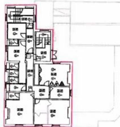
02 LICENSING PLAN - LEVEL 1 SCALE: 1/8" = 1'-0"