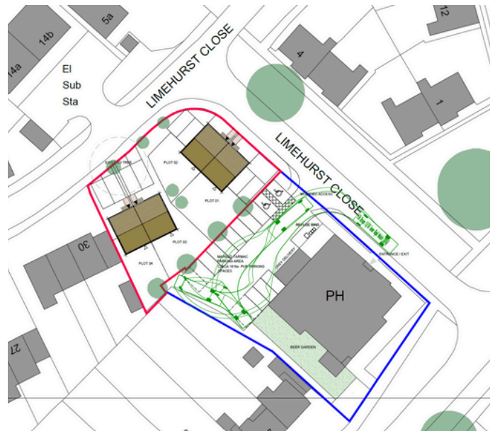
Proposed scheme - option 2