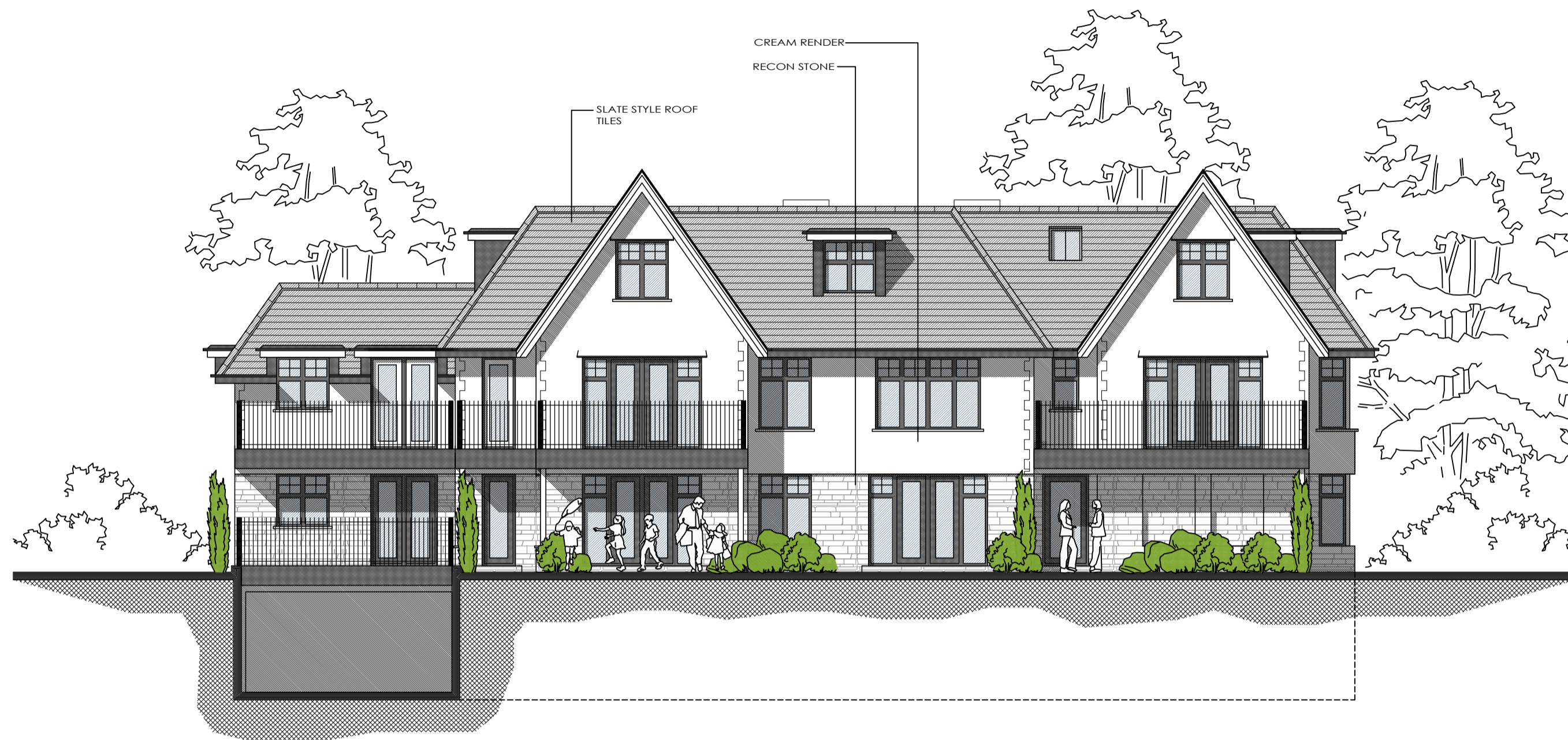
FRONT SOUTH WEST ELEVATION SCALE 1:100

Note: Any design or details relating to Fire Safety, including under Part B of the Building Regulations is shown for indicative/information purposes only and is subject to appropriate external professional input. No assumption of any responsibility is accepted.