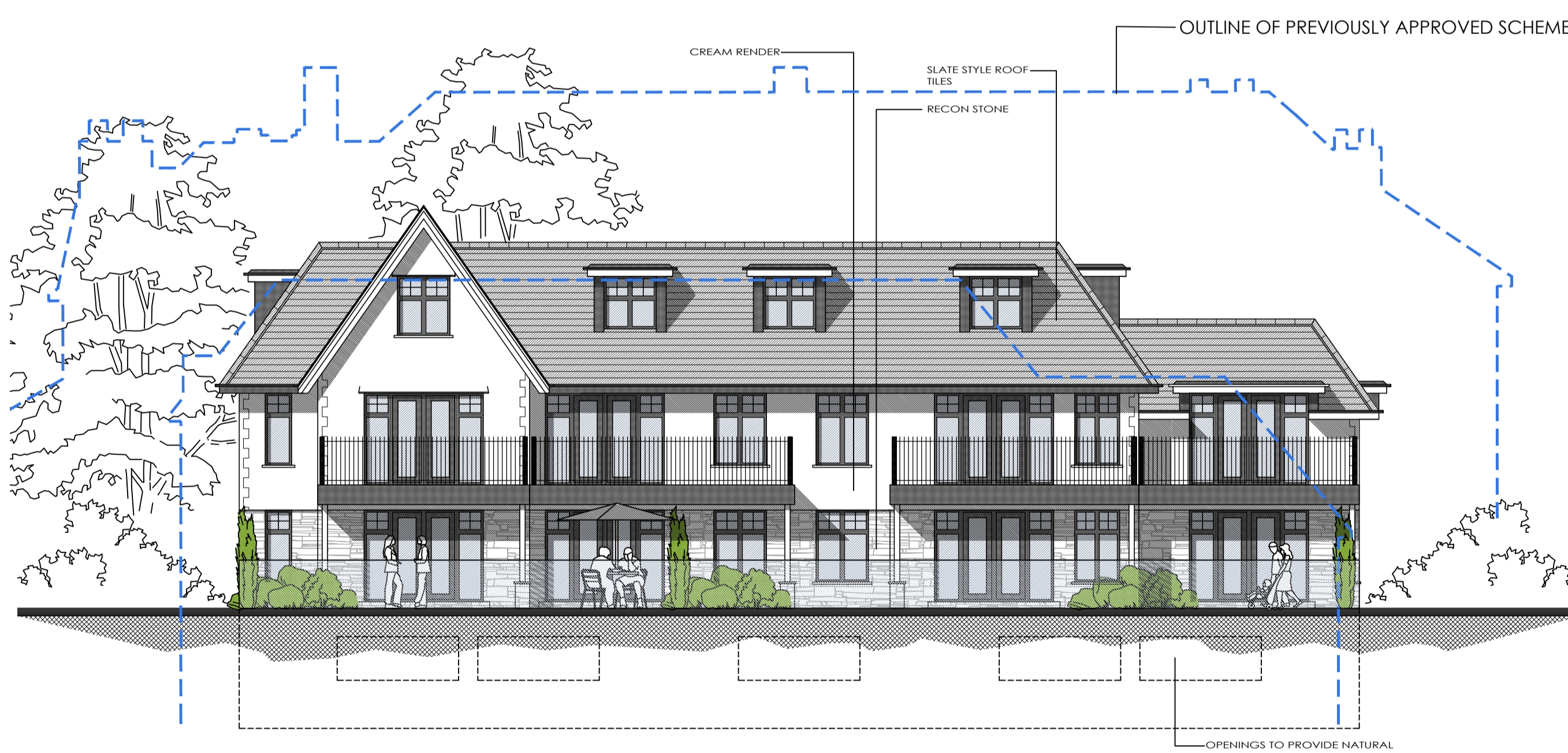
REAR NORTH EAST ELEVATION SCALE 1:100