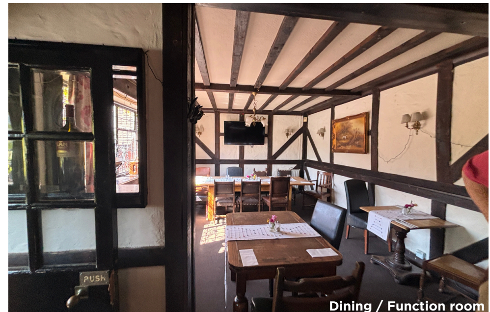
Dining / Function room