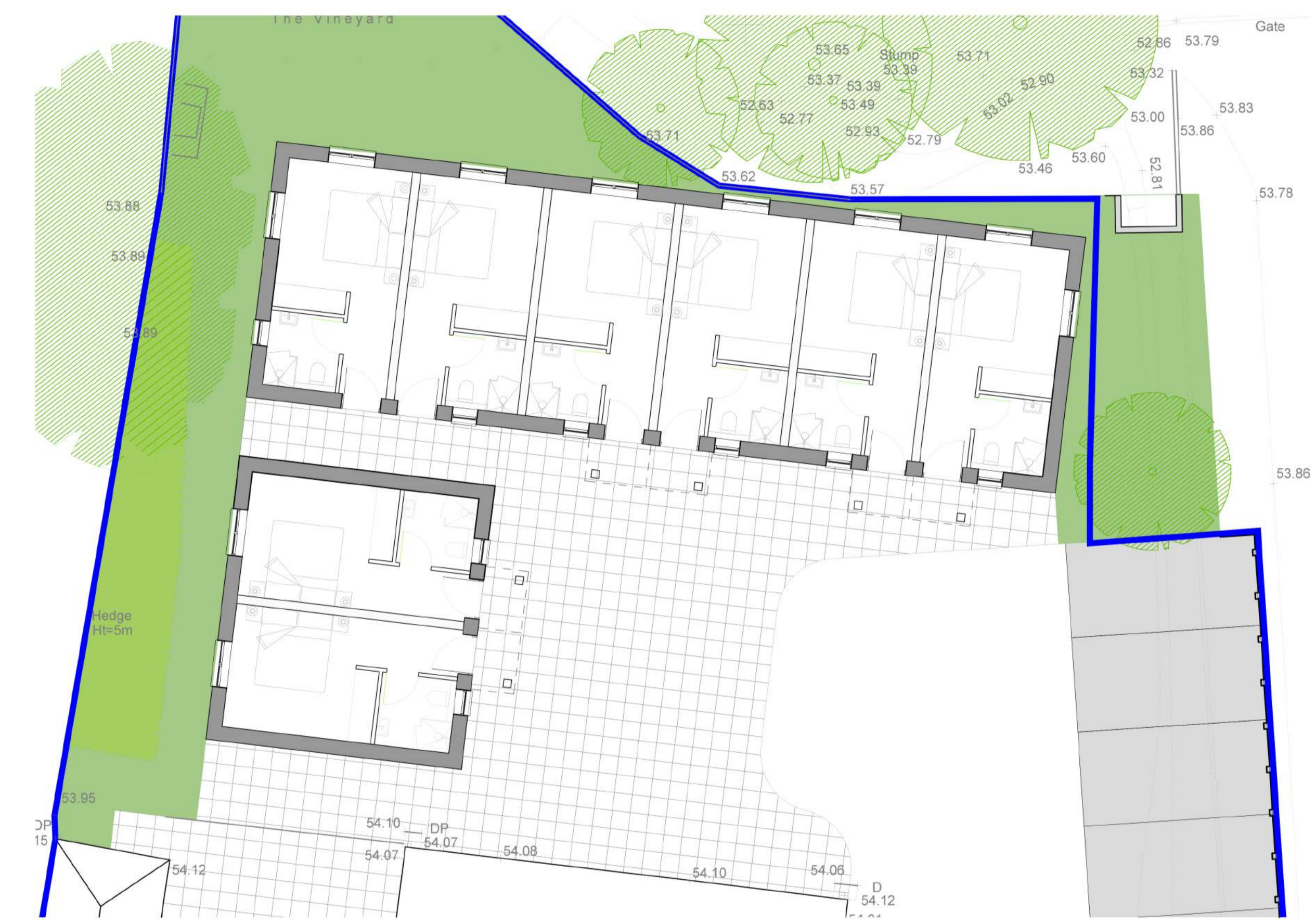
PROPOSED FLOOR PLAN scale 1:100