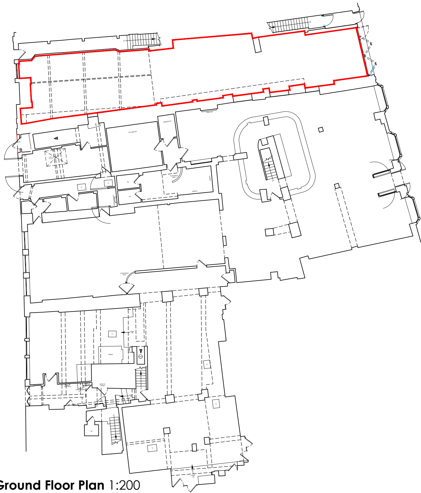
Ground Floor Plan 1:200