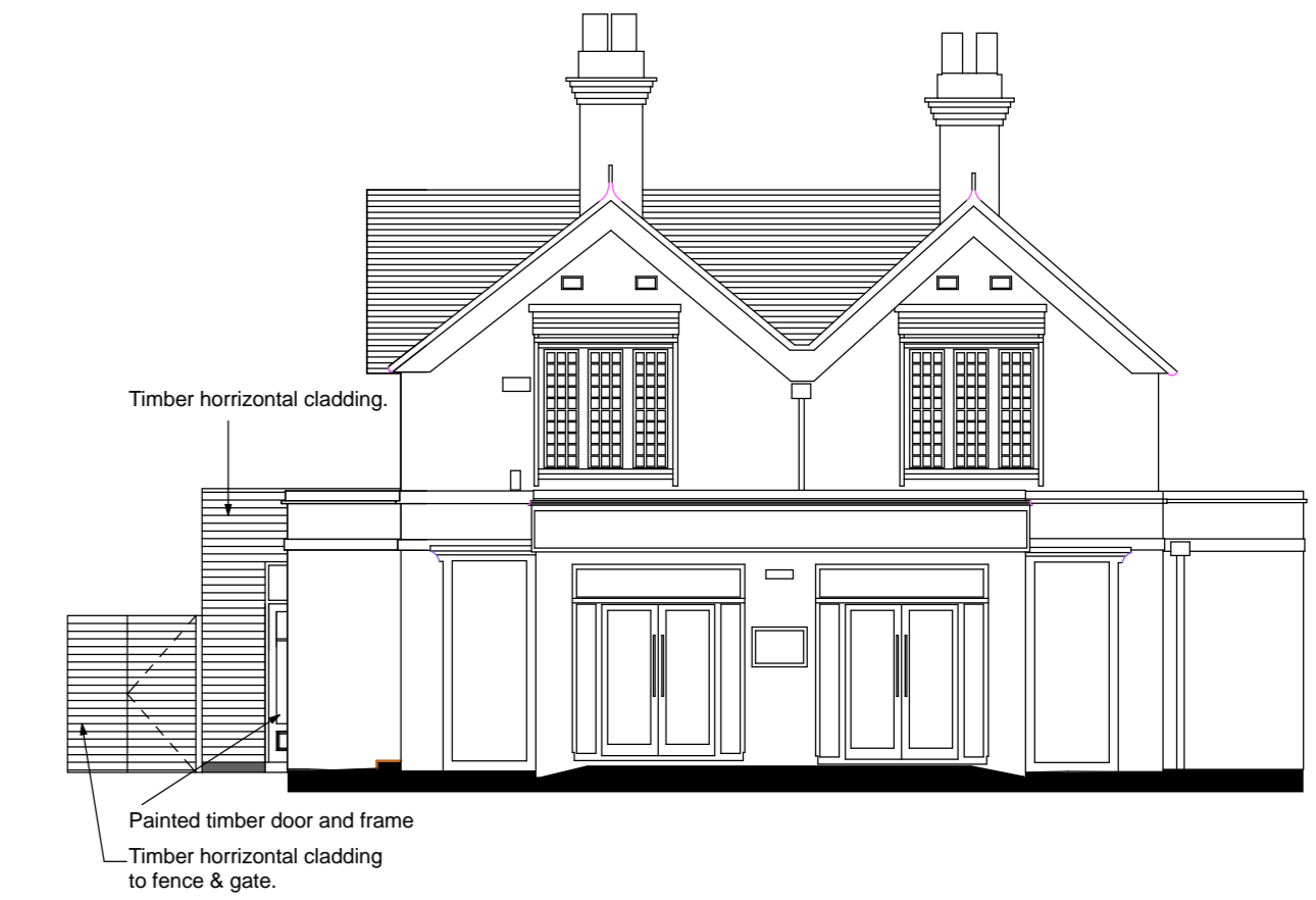
Proposed Elevation A