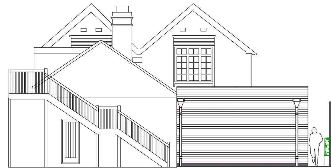
Proposed Elevation C