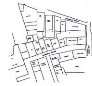
Site Plan 1:1250