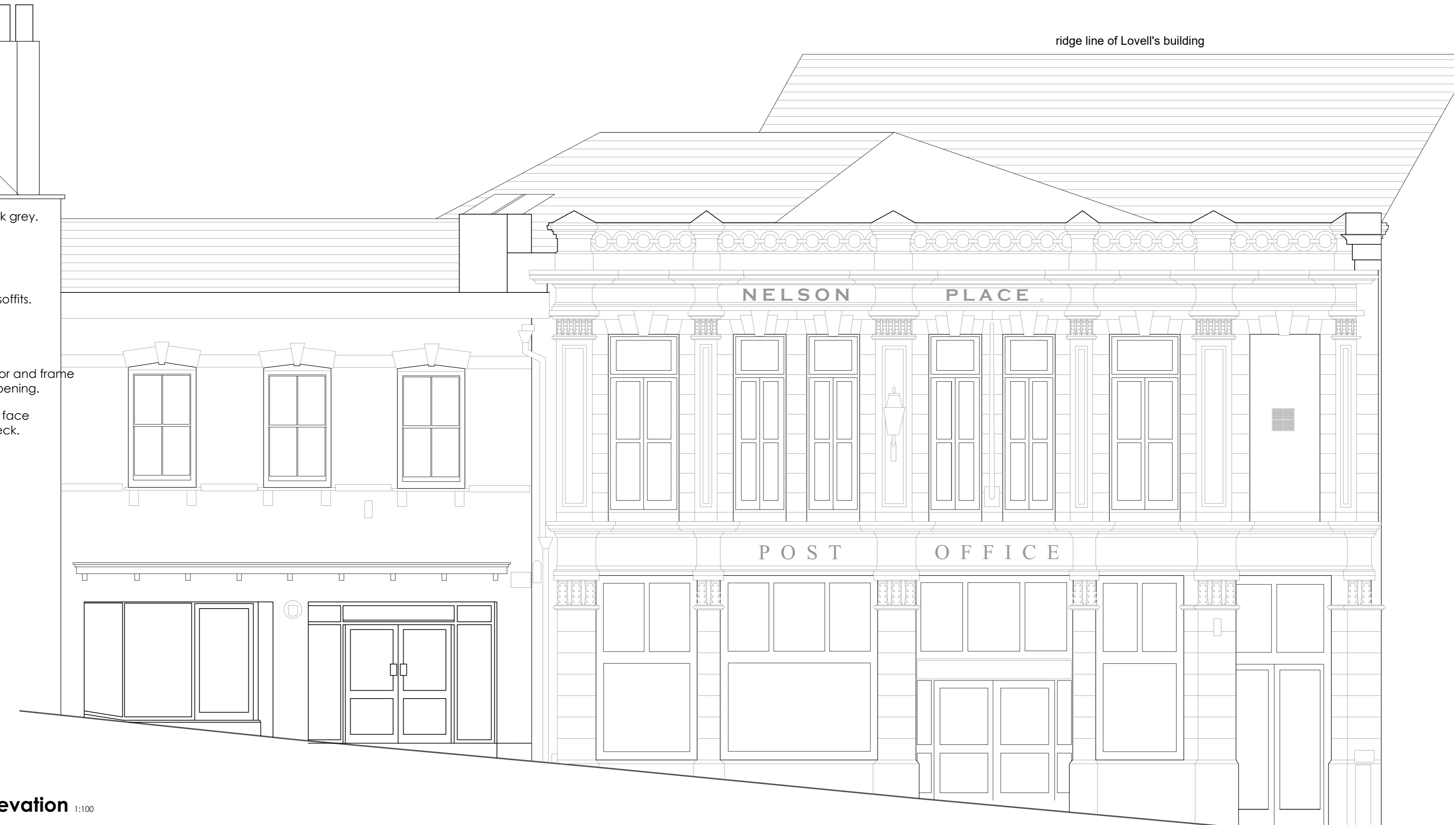
South Elevation 1:100