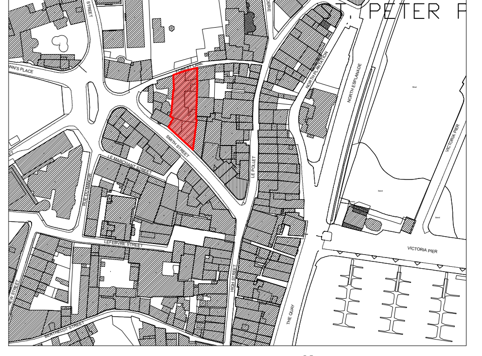
Location Plan 1:2500 Copyright 2019 State of Guernsey/Digmap Ltd Digmap Science No.109

AMENDMENTS A - 07/07/20 - GWH - Various revisions as requested by Building Control highlighted in red. B - 14/07/20 - GWH - Additional information added in regards to Fire Safety as requested by Building Control C - 04/08/20 - GWH - Dry Riser Added.