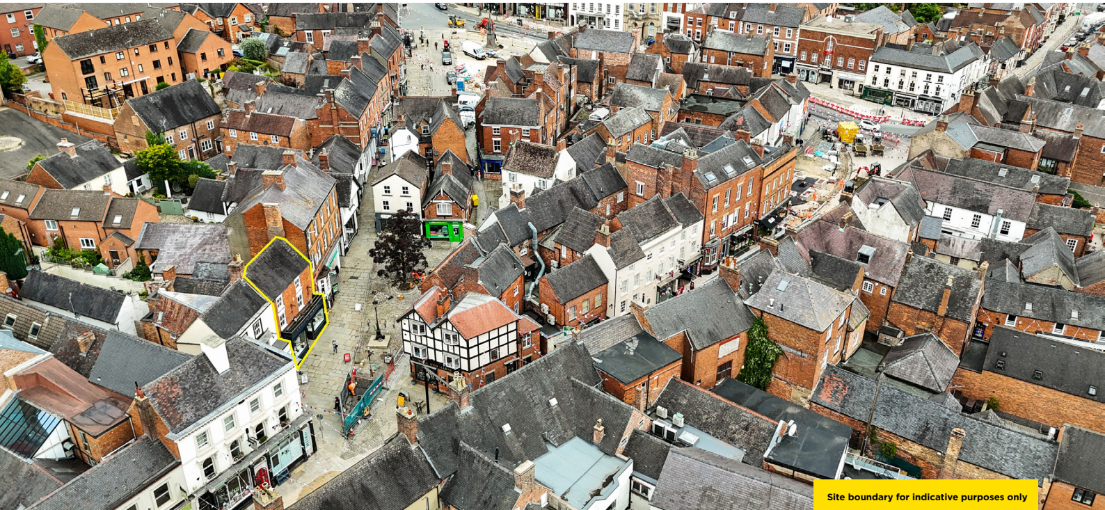
Site boundary for indicative purposes only